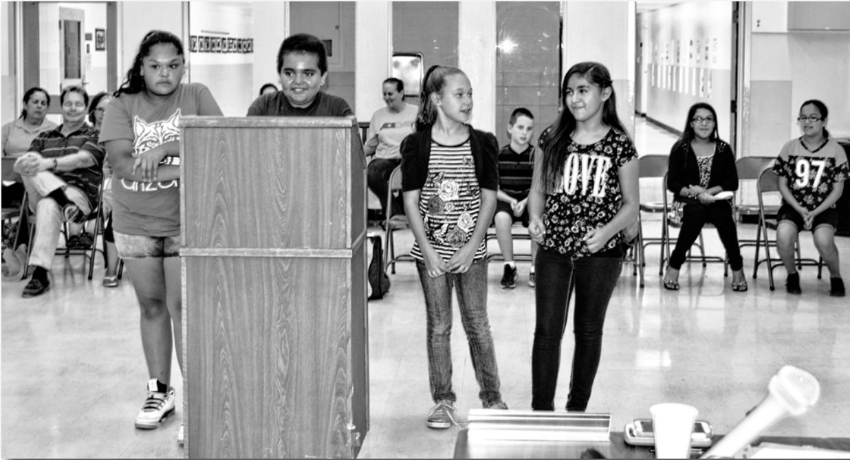
JFK Student Council addresses Governing Board.