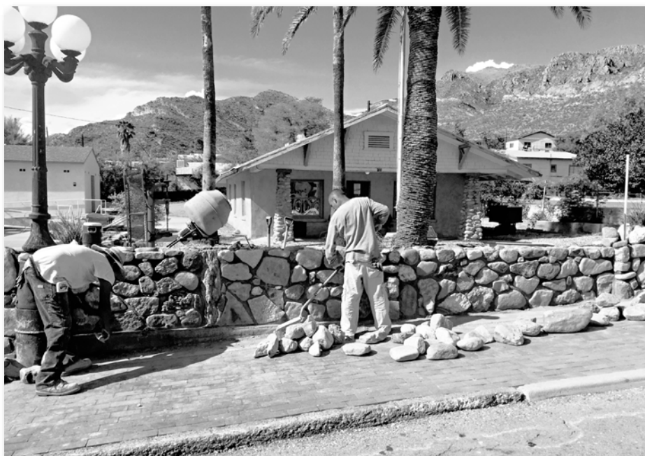
Working on the wall at the Bob Jones Museum.