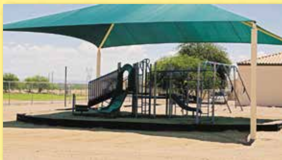
Another shaded playground area on the S.T.E.A.M. Prep Academy campus.