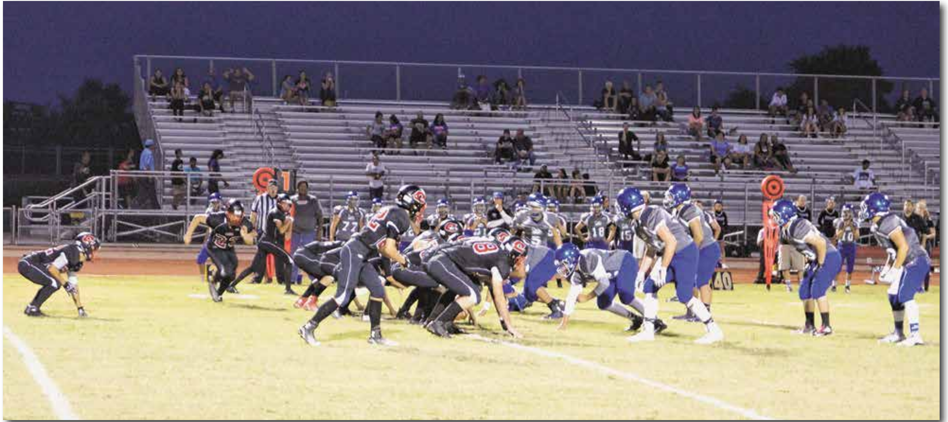
Battle of San Tan Valley - STFHS (Gray) vs. Combs (Black).