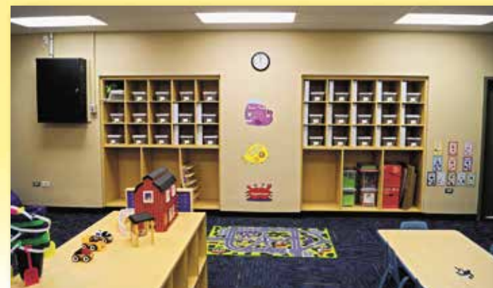
Each room is designed with shelving units like this. Each child is assigned their own cubby.