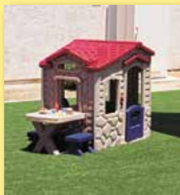
A little picnic area on the S.T.E.A.M. Prep Academy campus.