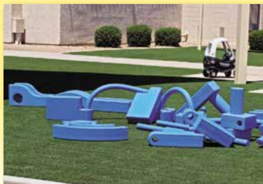
Outdoor play area where children can learn engineering by building things out of these foam pieces.