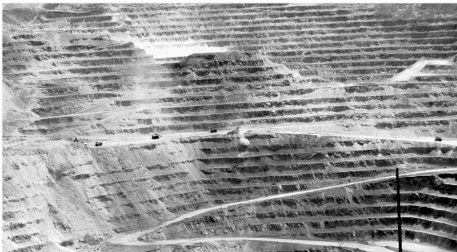
Asarco's Ray Mine near Kearny.