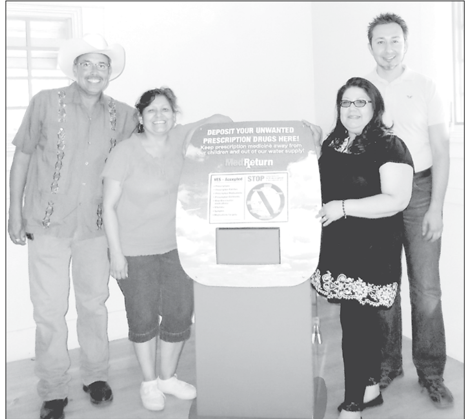
Members of the Superior Substance Abuse Coalition have been working for a while with PCSO to establish the prescription drug disposal box in Superior.

office and it would be disposed with the rest of the clinic's sharps. This method is also good for lancets used by diabetics to check their blood sugar levels. For inhaler tubes and other goodies Inhaler tubes, the pharmacist said, can just be thrown away in the household trash.