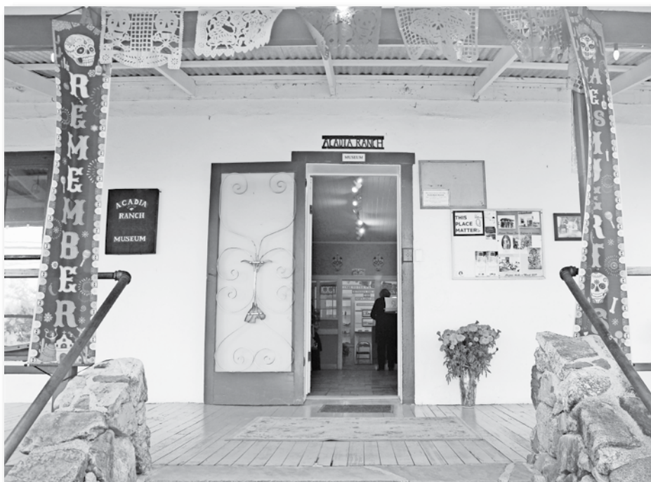
The Oracle Historical Society's Acadia Museum.

Thank you, BHP and Local First AZ, for helping our community!