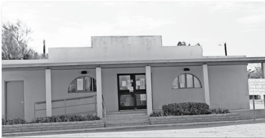
The Trii-Community Food Bank in Mammoth.