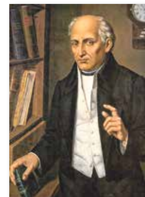
Miguel Hidalgo, siglo XIX, imagen tomada de: Jean Meyer, "Hidalgo", en La antorcha encendida, México, Editorial Clío, 1996, p. 2.

According to witnesses present at the original event, Hidalgo and his followers had shouted "¡Mueran los gachupines! Viva la Virgen de Guadalupe!" ("Death to the Spaniards! Long live the Virgin of Guadalupe!"). To this day residents of Mexico City, as well visitors, congregate annually on the Zócalo (central plaza of Mexico City, and the site of the ceremonial heart of the Aztec nation) to participate in the ritual of "El Grito" (The Cry). Mexico's presidents have stood on the main balcony of the National Palace to ring "Hidalgo's Bell" from Dolores, and lead the patriotic cry of "Long Live the Hero's of the Nation! Long Live the Republic!", and every year thousands of voices have shouted in reply "¡VIVA!"