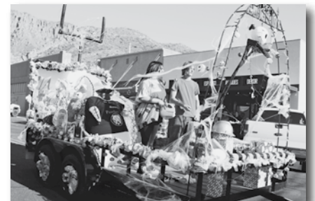
Senior Float – Second Place