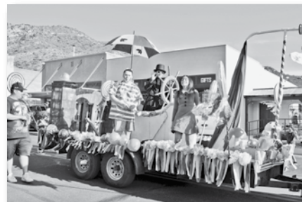
Junior Float – First Place