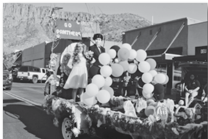
Freshmen Float – Third Place