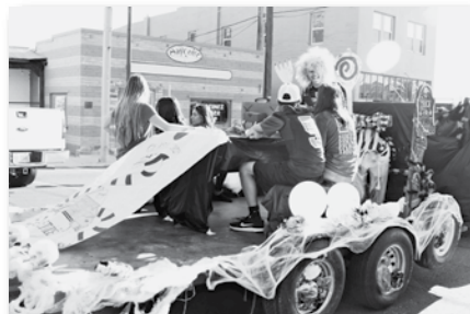
Sophomore Float – Fourth Place