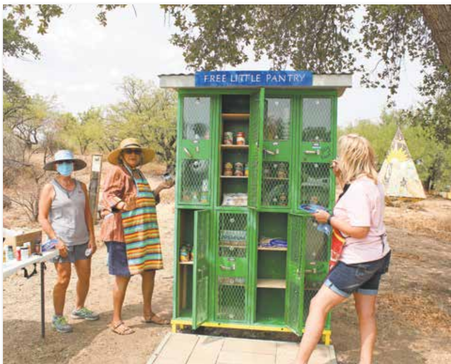
Artists put the final touches on the Free Little Pantry that has taken up residence in the Butterfly Garden on American Avenue in Oracle.

“Take what you need, bring what you can.”