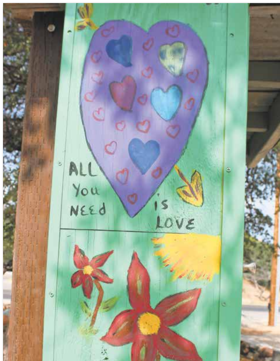
Artwork dominates one side of the Free Little Pantry while the other side has the 'rules' listed.