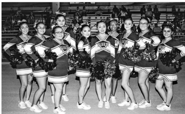
Superior's Spirit Line were ready and able to cheer on the Panthers at Friday night's home game.