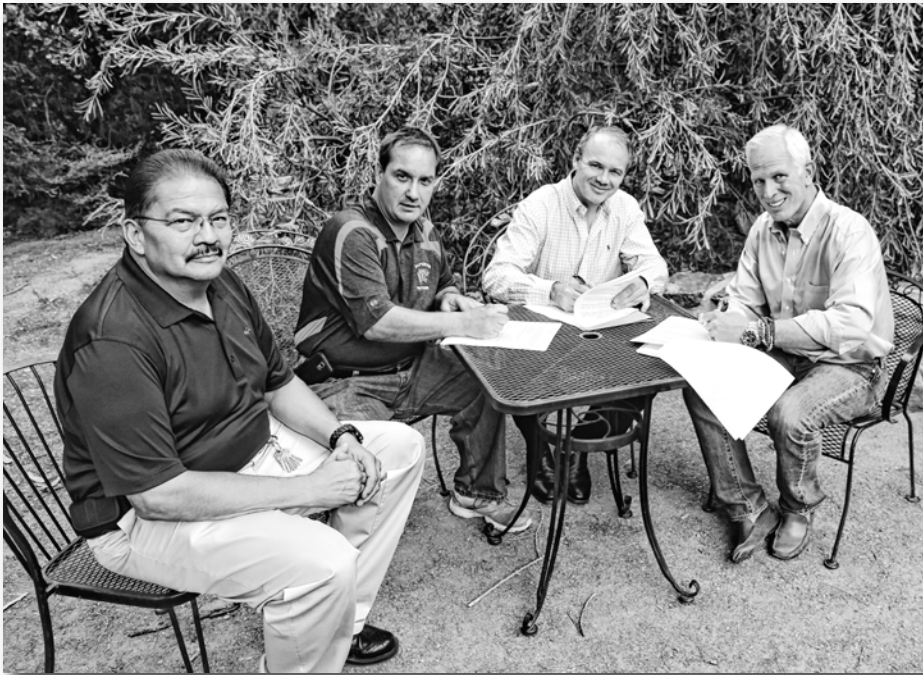
Officials from Superior Schools, Resolution Copper and the Arboretum sign a joint agreement for the JFK Nature Club.