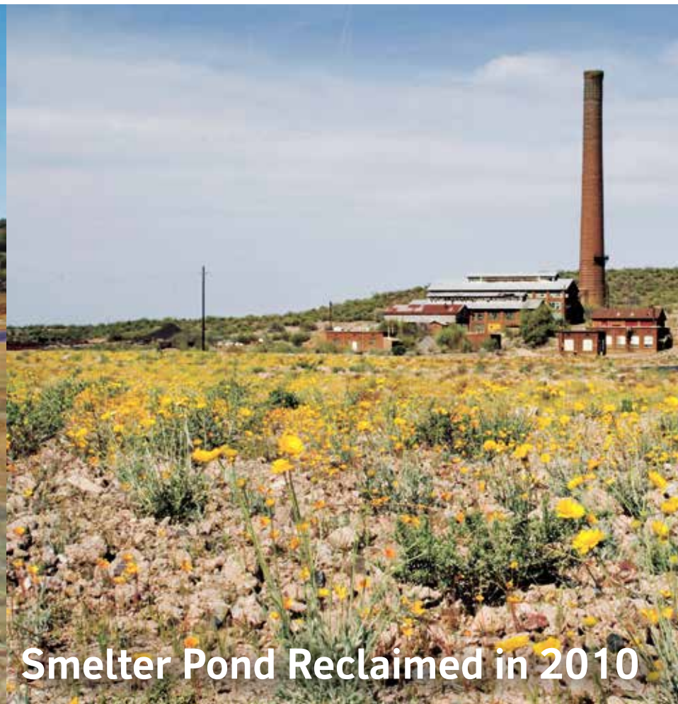
Smelter Pond Reclaimed in 2010