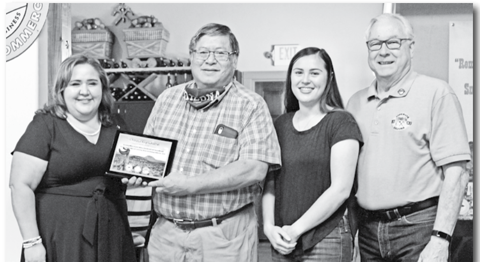
Save Money Market