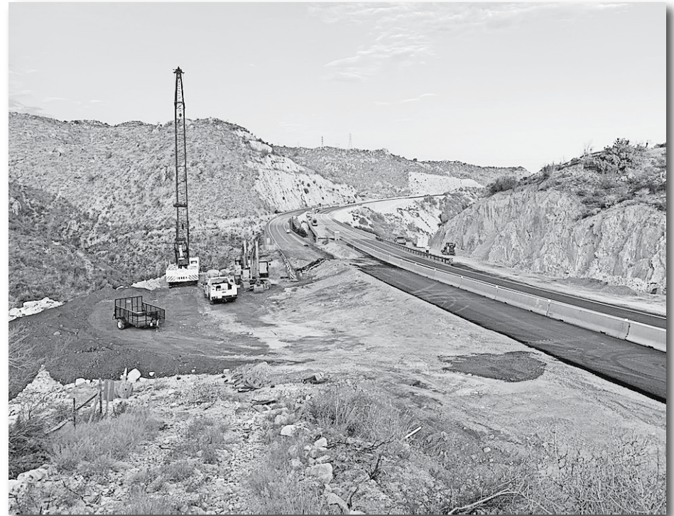
Pinto Creek Bridge now open for traffic.

More information about the project is available at azdot.gov/PintoCreekBridge .