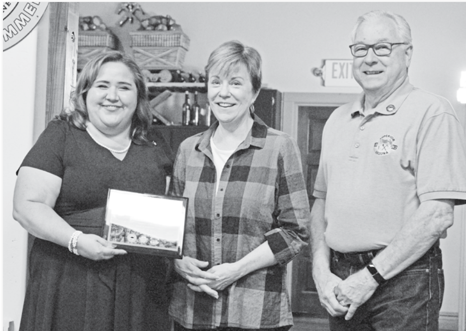
Boyce Thompson Arboretum