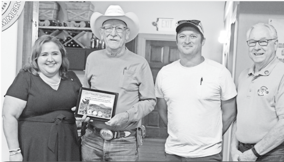
Albo Guzman Construction