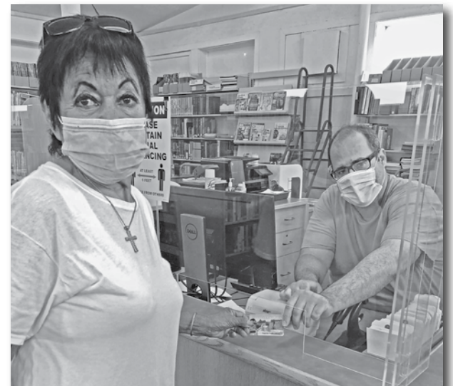
Sign up now for a library card.