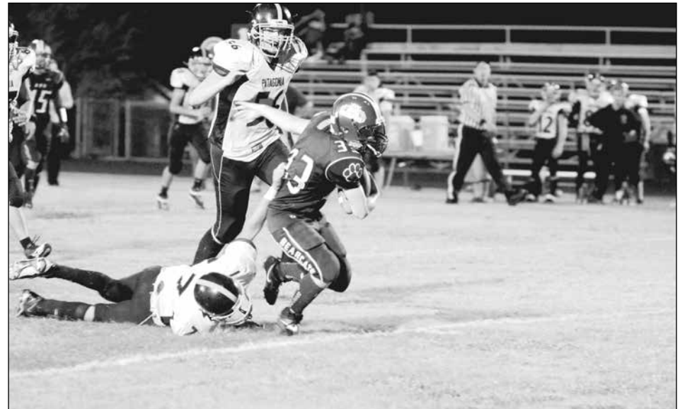
A Bearcat ball carrier appears to drag a Patagonia defender behind him as he heads to the goal.

The Bearcats return to action when they take on a 2 – 1 Hayden team on Sept. 20, 2013, at 7 p.m. for the annual Homecoming game.