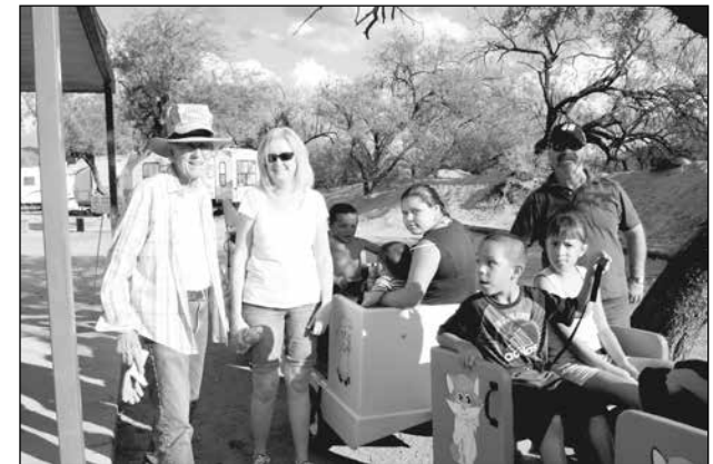
See more online at copperarea.com