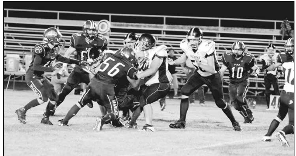
The Bearcats and Lobos fight for possession of the ball.

The Bearcats will entertain arch-rivals, the Hayden Lobos with kick- Homecoming, Page 13