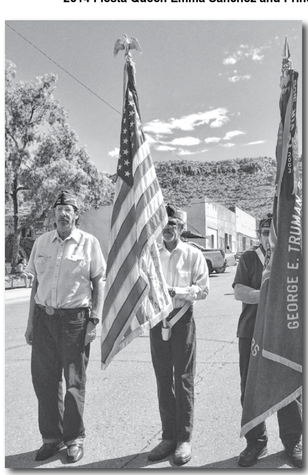
Presenting the colors