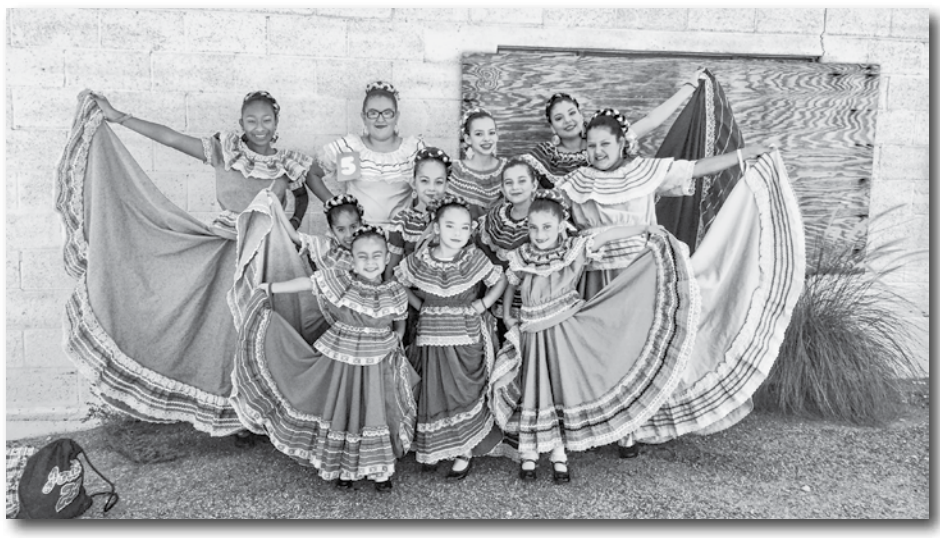
Baile Folklorico Alma de Superior