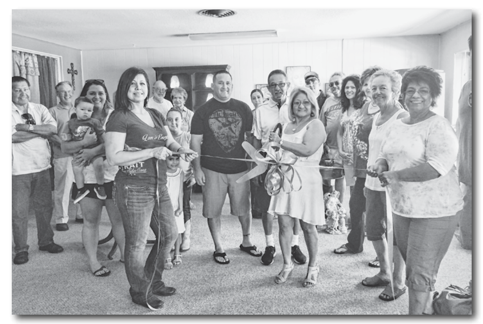
A ribbon cutting makes it official! The Superior Chamber of Commerce officially welcomed Sole to Soul Awakenings to its business ranks Saturday.