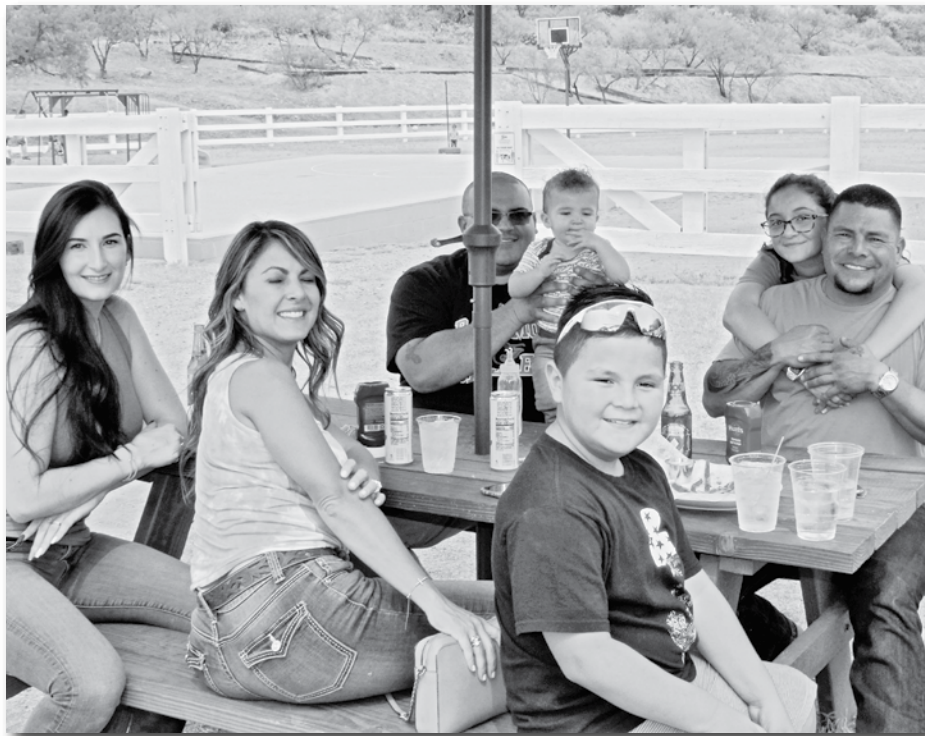
A local family enjoys a wonderful meal outside at the 3C Ranch.