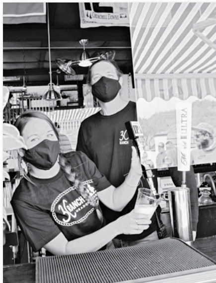
Servers at the 3C Ranch Restaurant are happy to be back to work.

The historic 3C Ranch offers room rentals, wedding and event venues, 3D-Archery Range, bocci court, cornhole, kid's playground, laundry room, gym and more. For new kitchen and bar hours and more information about rentals, visit www.3cranchaz.com or call 520-896-2372. You can also like them on Facebook.