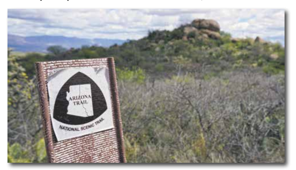
AZT in a Day? Absolutely. Sign up now to hike, bike or run your segment. Plus it's guaranteed to fit social distancing in this time of COVID-19.

To sign up, or for more information about AZT in a DAY, visit aztrail.org/events/aztinaday-2020/, email karrie@aztrail.org, or call (520) 261-8460.