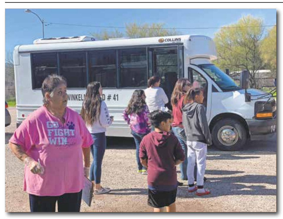
Hayden-Winkelman Schools will be extending its Summer Free Food Program through the end of the year. Meals are free for any child through age 18 regardless of whether they live in the district or not.