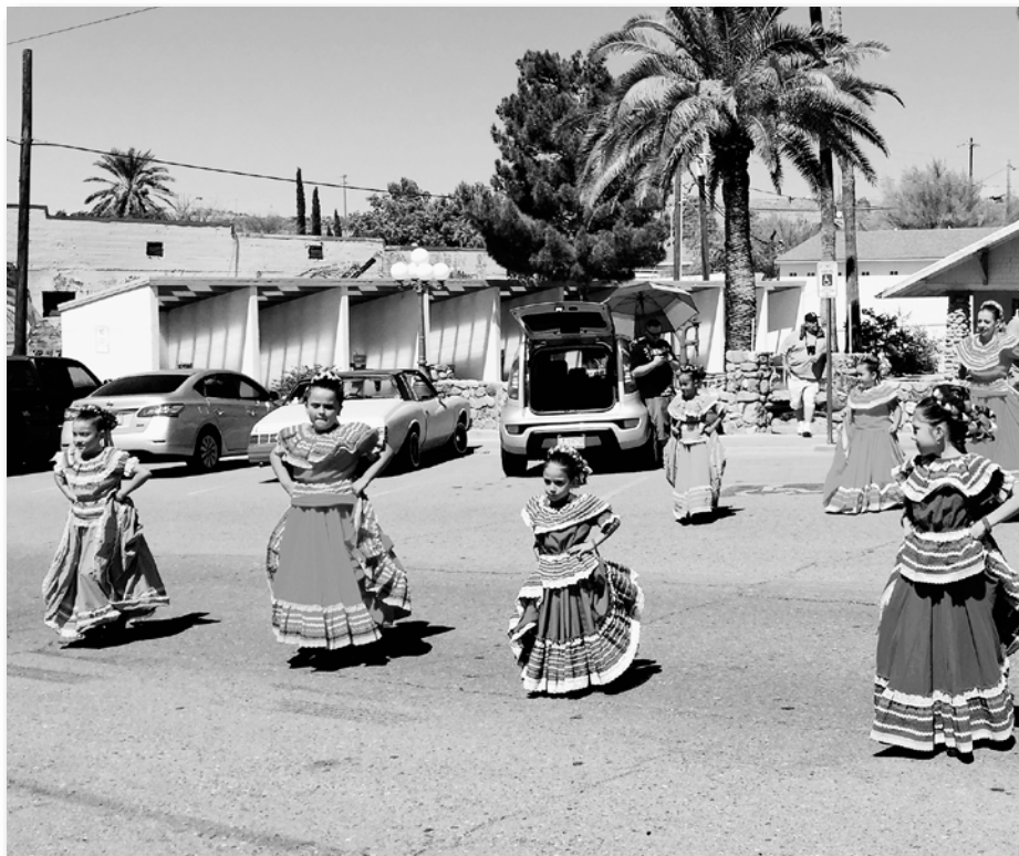
Baile Folklorico Alma de Superior performs at the St. Francis Fiestas Patrias.