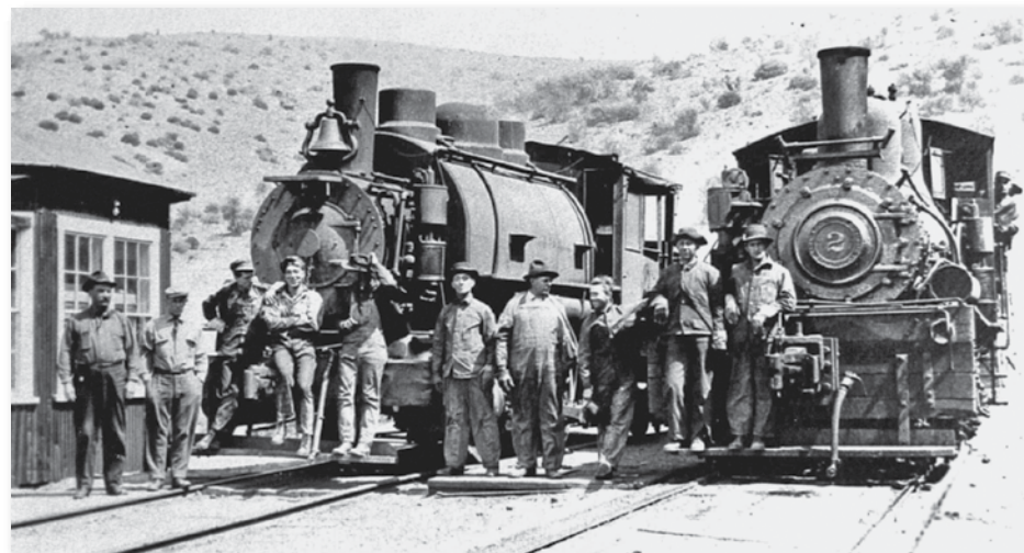
The railroad was brought into Globe in 1898, greatly increasing the profitability of the mine. Pictured is a 1917 train crew that worked for Old Dominion Mine.

Tickets can be purchased at the Gila Historical Museum (928-425-7385), the Globe-Miami Chamber of Commerce (928-425-4495) and Turn the Page (928-910-9033)