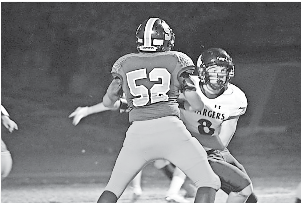
Superior all but crushed Arete Prep at Friday night's game.