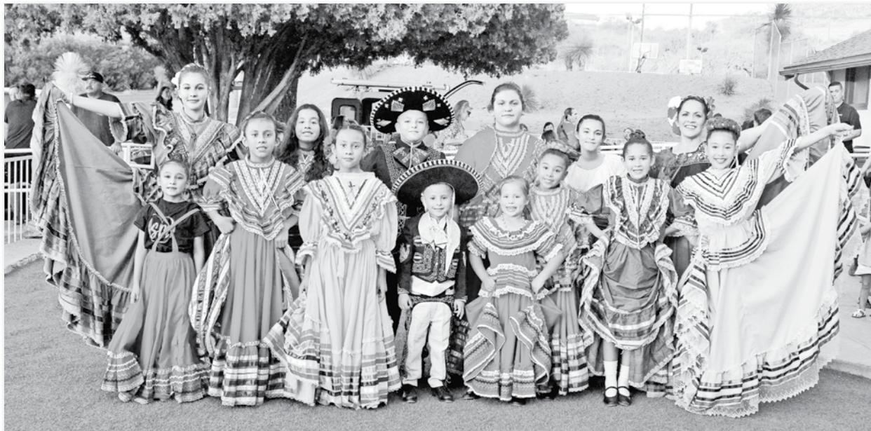
The Superior Dance Company provided entertainment at the Rural Policy Forum.