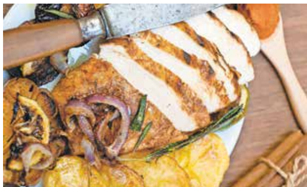
Chicken Breast Boneless • Skinless $1.99/lb