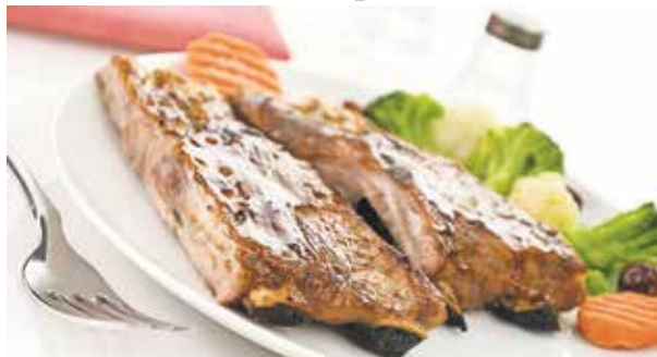
Pork Riblets Seasoned Rib Strips • Grill Ready $1.69/lb