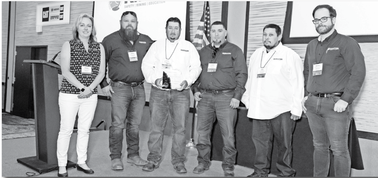
Resolution Copper's team accepts the 2023 Safety Award from the Rocky Mountain Mining Institute.