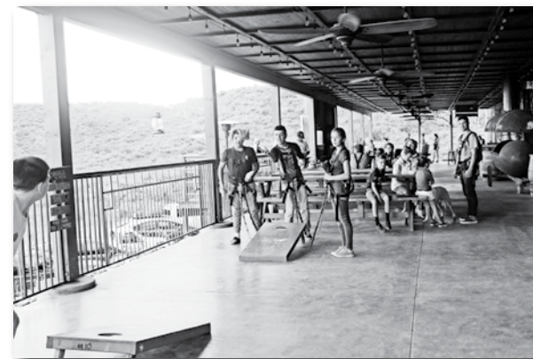
Despite the threat of rain there was a good turnout for the Tri-Community Appreciation event. There was some delay in zipline times due to the threat of lightning but those attending had a good time. Visitors included the Oracle Firewise members and local kids from the Carlink Ranch in Redington.