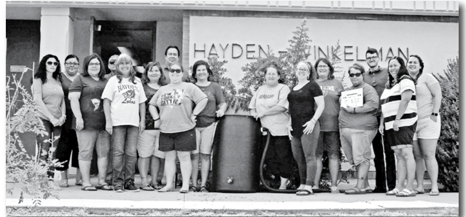
The 19 teachers who completed the Project Harvest Water Harvesting Workshop.

Topics of the workshop held late last month included climate change, health and environmental quality. Participants learned