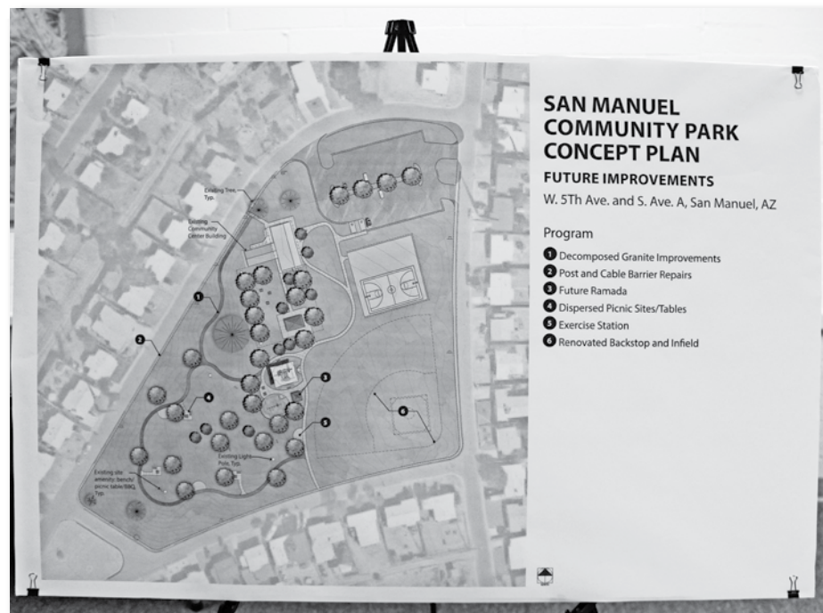
A conceptual view of the San Manuel Community Park.