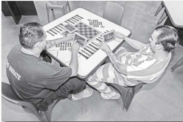
Inmates work with the SecureView® Tablet.

The Pinal County Sheriff's Office's Adult Detention center houses an average of 500 inmates a day. The tablets are monitored and the inmates are aware that their activities and all forms of conversations are monitored, which is standard practice at all detention facilities.