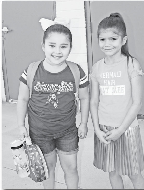
These two young ladies are happy to be back at school after the summer break.