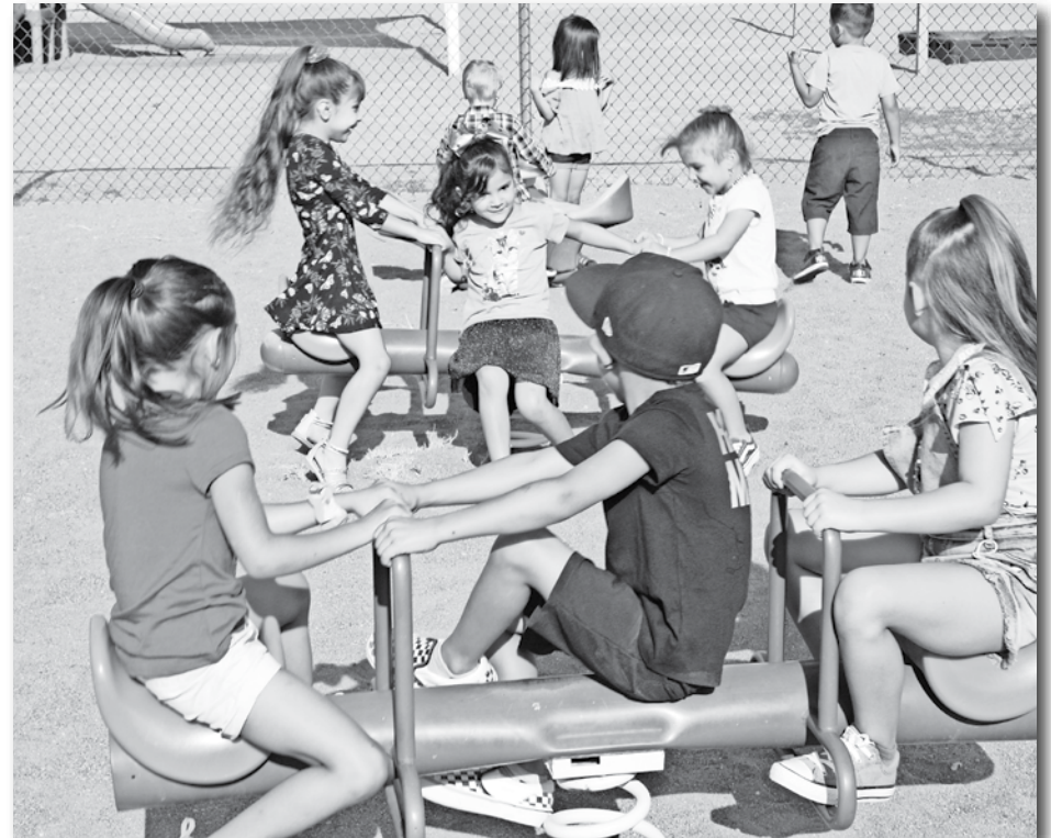
Some kids at Hamby K-8 School in Winkelman line up to go to the cafeteria for a healthy breakfast (left) while others socialize on the playground (right).