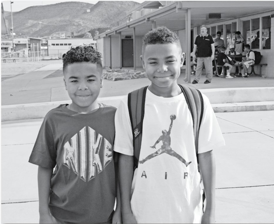
These two young men are happy to be back on campus, ready to learn.