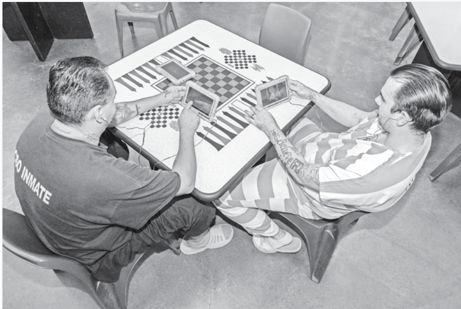
Inmates work with the SecureView® Tablet.

The Pinal County Sheriff’s Office’s Adult Detention center houses an average of 500 inmates a day. The tablets are monitored and the inmates are aware that their activities and all forms of conversations are monitored, which is standard practice at all detention facilities.