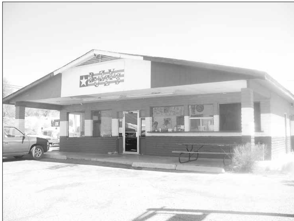
Buzzy's