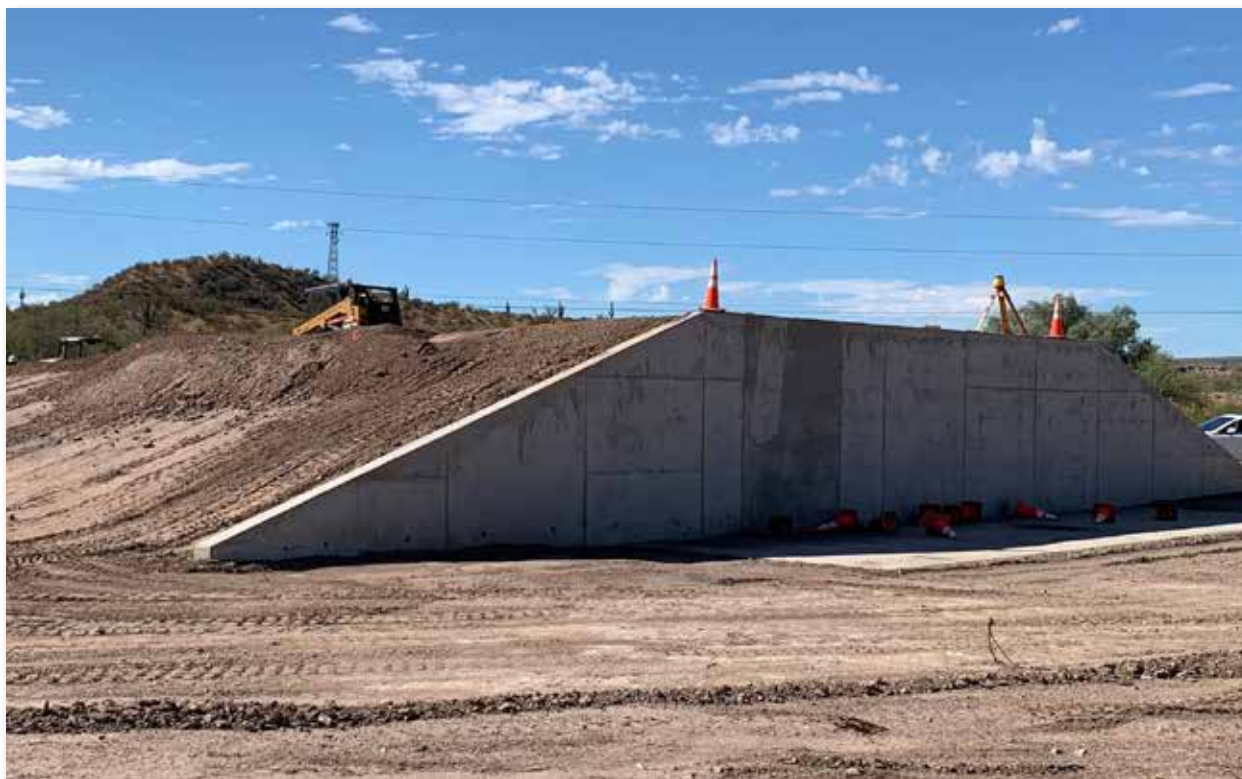
Dudleyville Landfill is being closed.

The proposed hours of operations will be every Friday and Saturday 8 a.m. to 4 p.m.