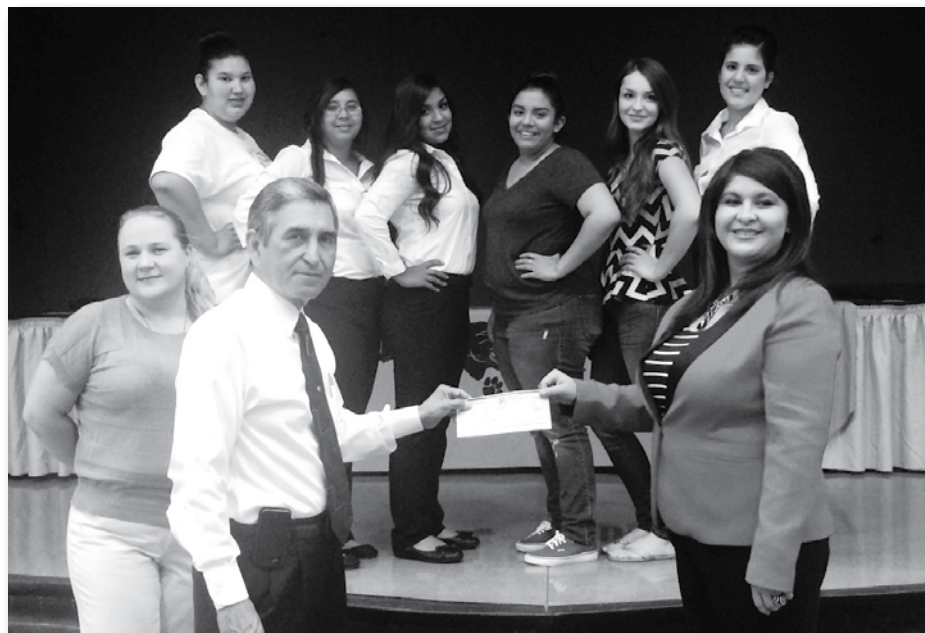
Superior FCCLA 2015 Nationals