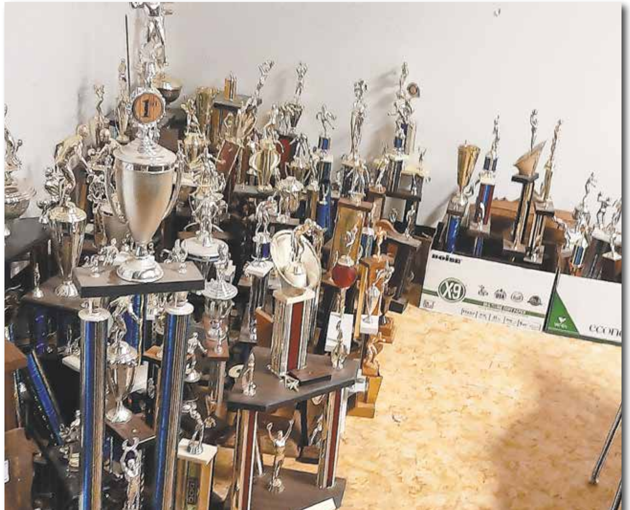
The trophies have been moved to a safe storage at the Mammoth-San Manuel School District Office.