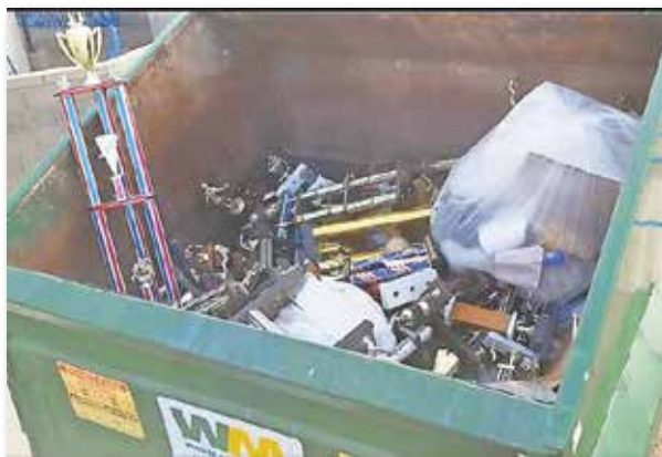
The photo that sparked outrage in the Tri-Community and Copper Corridor of the trashed trophies.