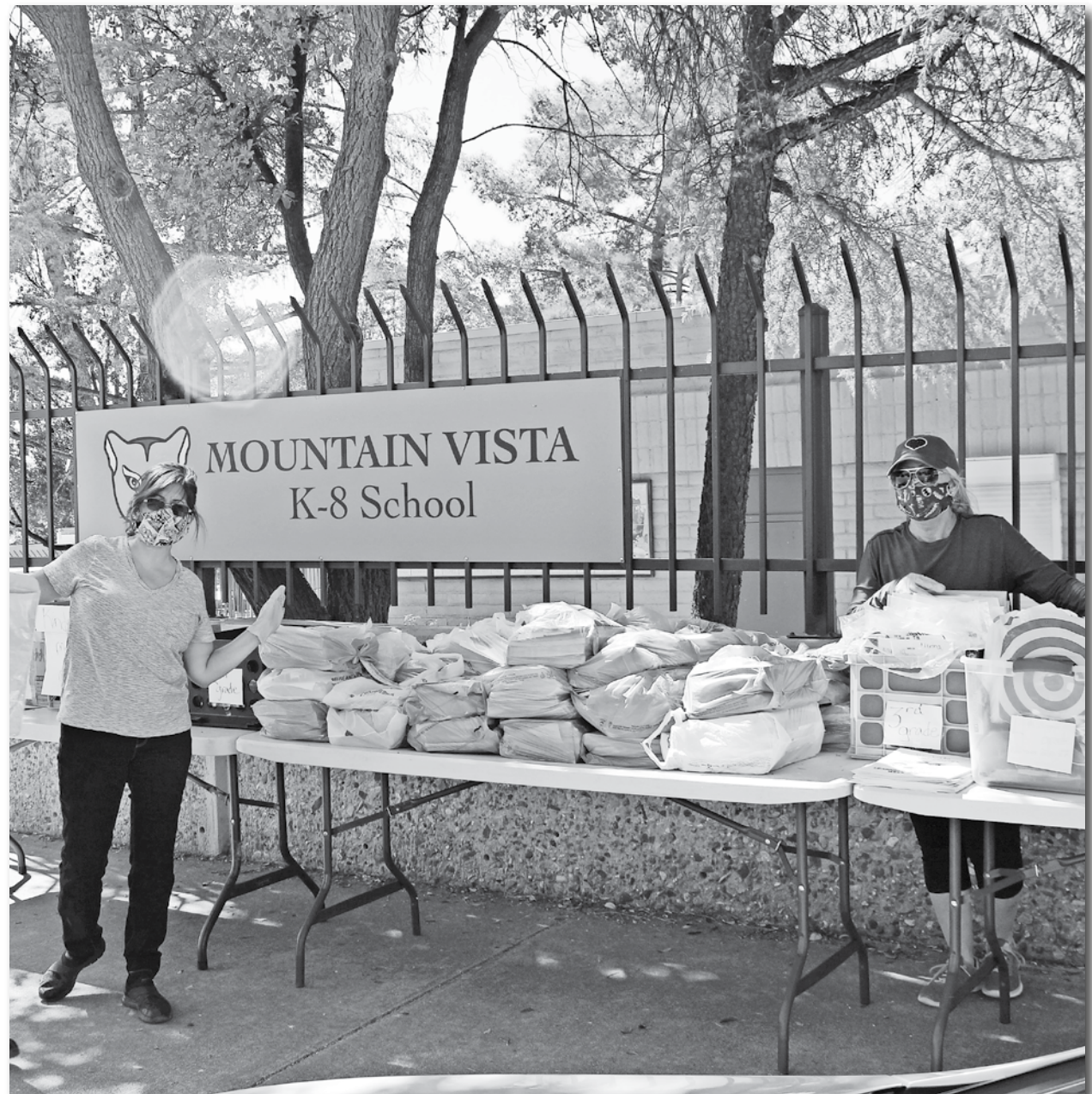
Mountain Vista K-8 School is ready for the coming school year. It will be online learning for MVS students at least through the first quarter.