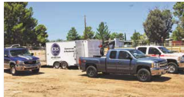
Emergency cleanup crews were at San Manuel Schools following a severe monsoon storm Wednesday.