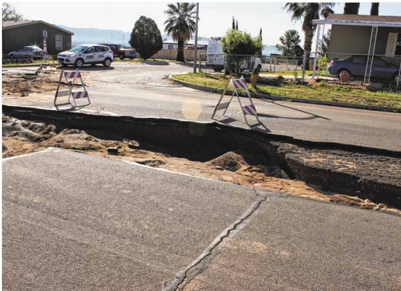
Water from the July 29 monsoon storm tore up pavement at the intersection of Avenue G and Ladera Place/Fifth Street in San Manuel. Pinal County Public Works Crews filled in the hole temporarily on Saturday to allow traffic to move through the area.

should take around two weeks. Once the Asphalt Course and Aggregate Base are repaired we will need to complete pavement preservation to existing roadways hit by the storm. That schedule will depend on weather conditions and other factors. All we ask is that the residents take caution when they are driving around the damage and to watch out for workers trying to repair the roads.”