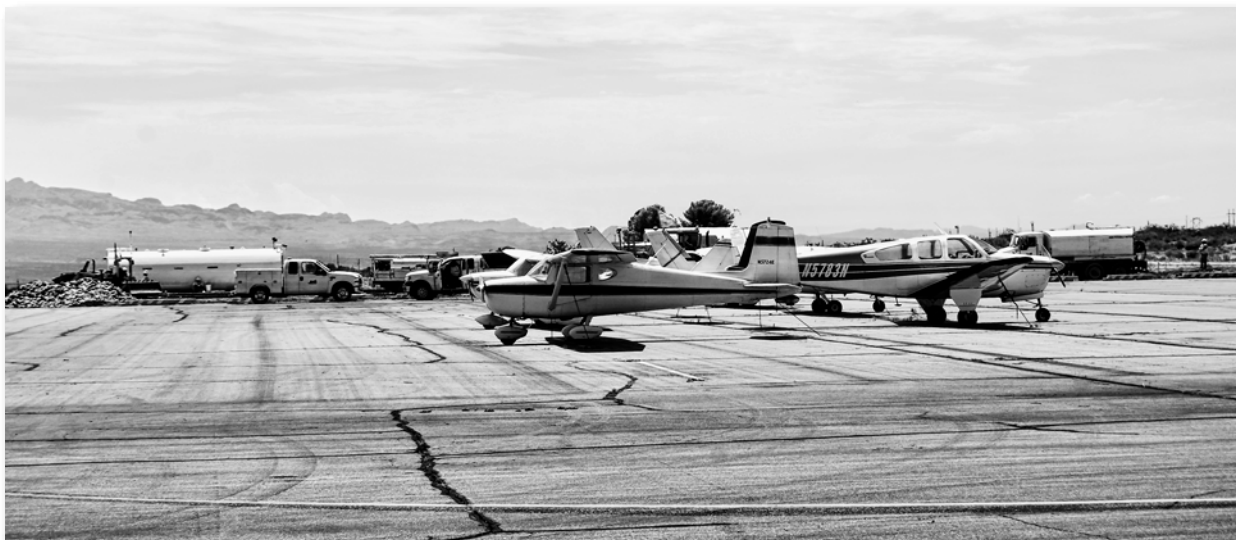
Additional tie downs are needed for the increasing number of planes housed at the San Manuel Airport.

The renovation and expansion of the San Manuel Airport will improve safety at the airport and attract people and business to the area. There are currently 23 people on the waiting list for hangars at the airport.