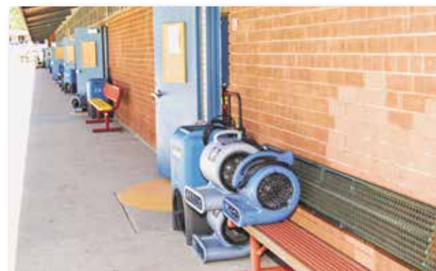
Blowers were used to dry out classrooms at First Avenue Elementary School following a severe monsoon storm Wednesday.