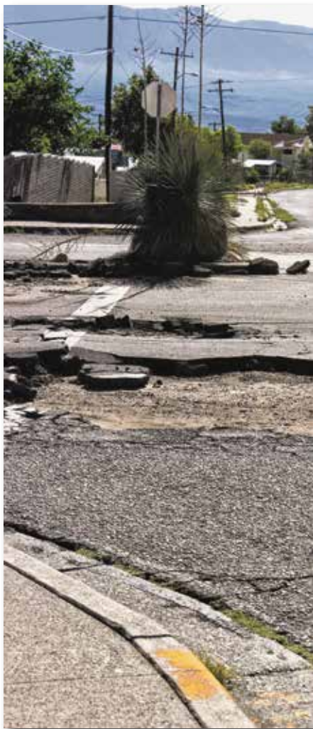
The roadway at the intersection of McNab Parkway and Webb Drive sustained asphalt damage as rushing water lifted the pavement up.