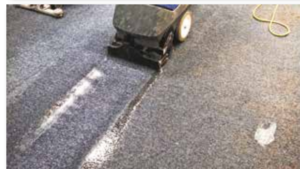
Water saturated several classrooms at First Avenue Elementary School. Maintenance crews have been working to ready the school for the students' first day back.