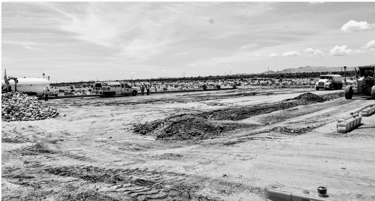
Contractors work to repave the ramp and taxi area at the San Manuel Airport.