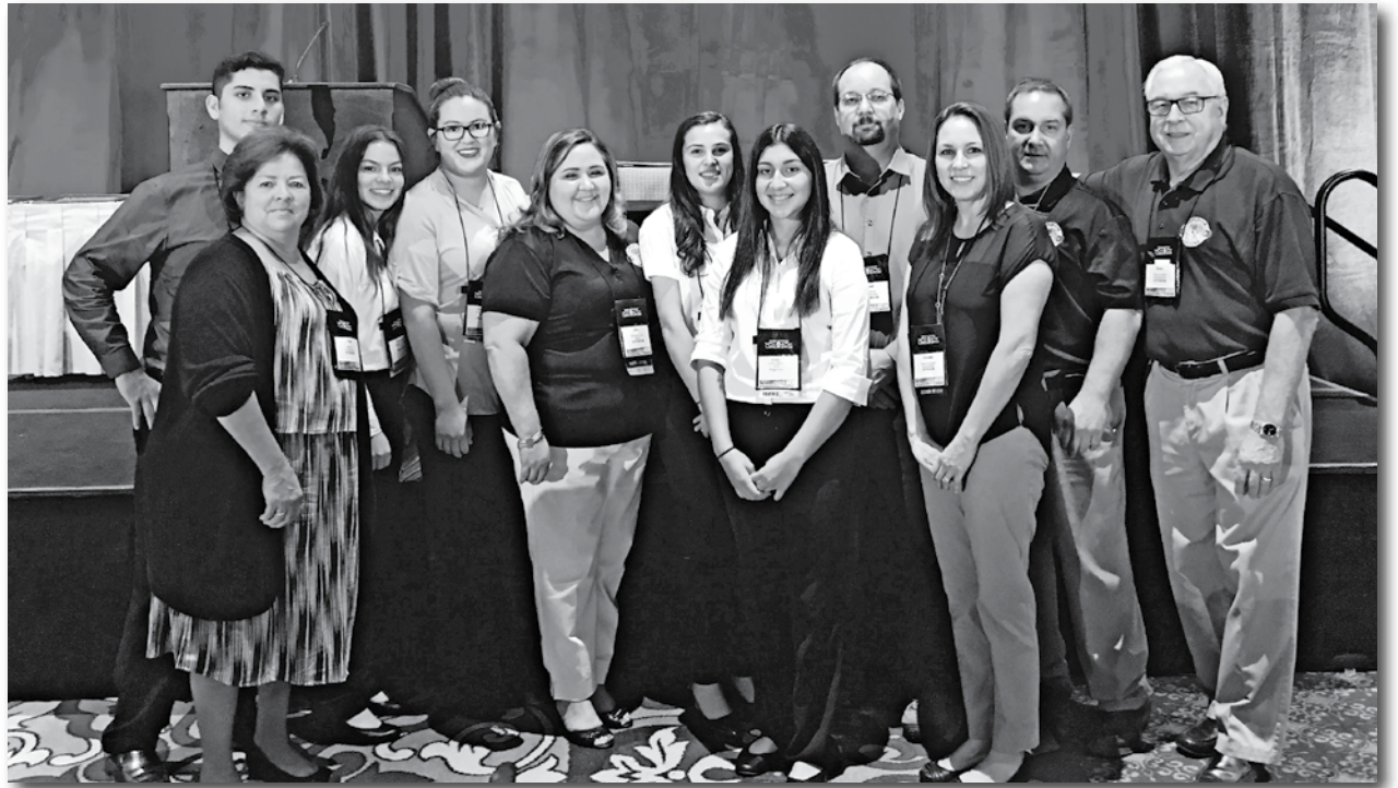
Superior's delegation to the League of Arizona Cities and Towns.