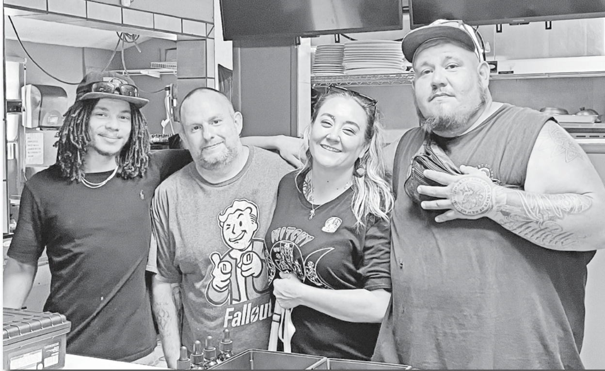
The Phat Flavors crew.

Phat Flavors and FamBam Genetics are scheduled to host the “Spooky Social” in late October, with live music, more vendors, a pie-eating contest and a costume contest.