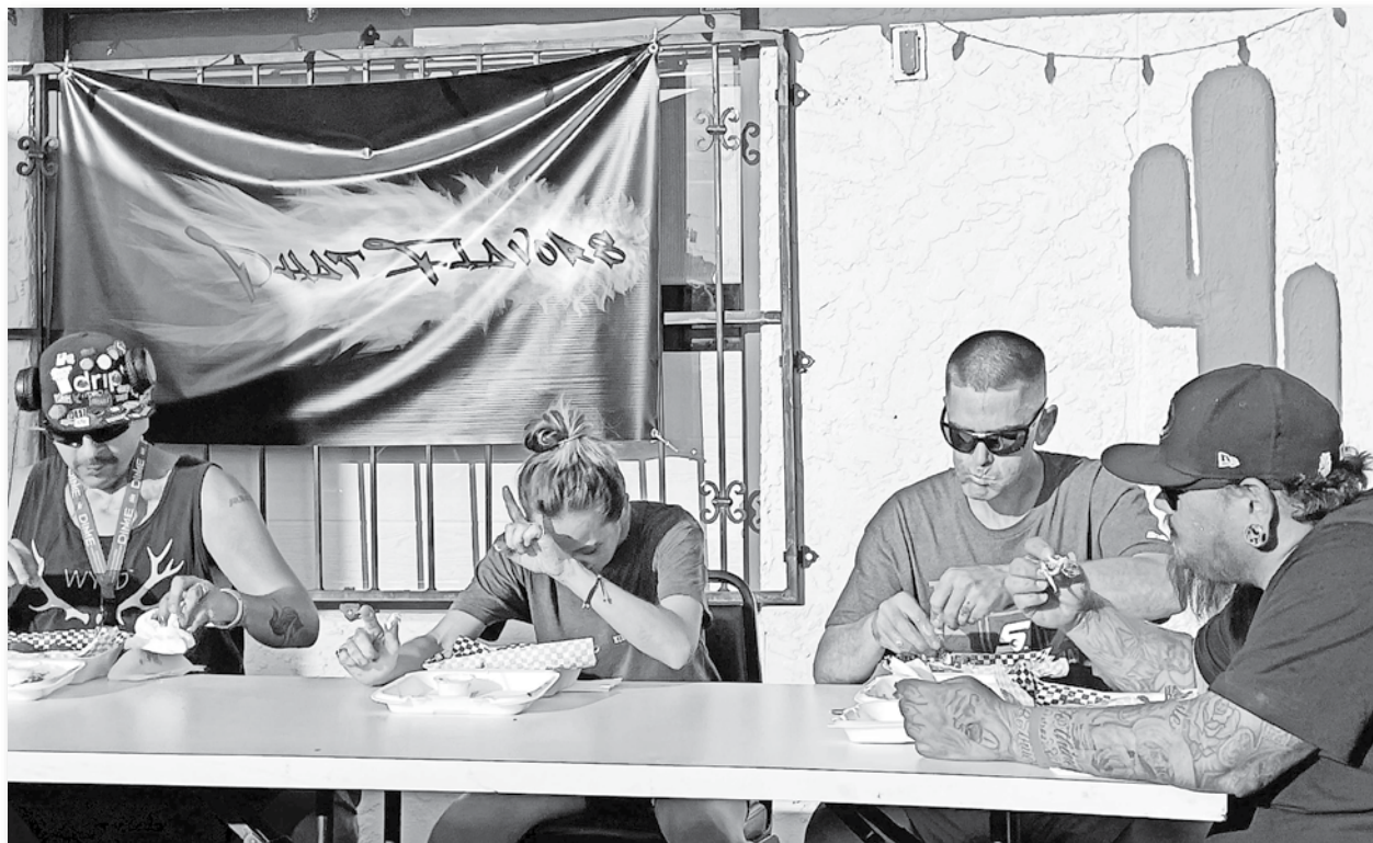
Braving the new hot wings at Phat Flavors.

Only five people were brave enough to test their might against the brand new Phat Flavors hot wing competition. The goal was to devour 12 dangerously hot wings in under ten minutes. Eyes watered, while fingers and faces got covered in sauce, some competitors even had