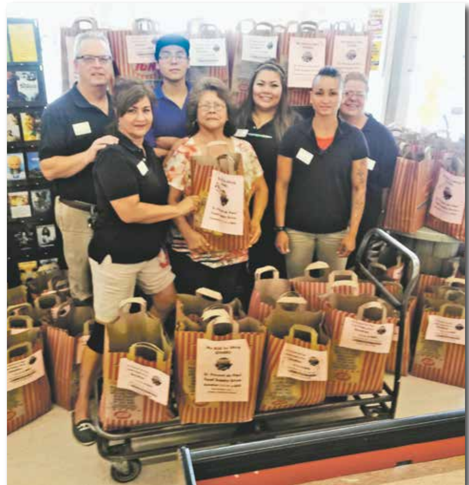
Employees at Norm's Hometown Grocery help deliver bags of food donated by the grocery store's customers.