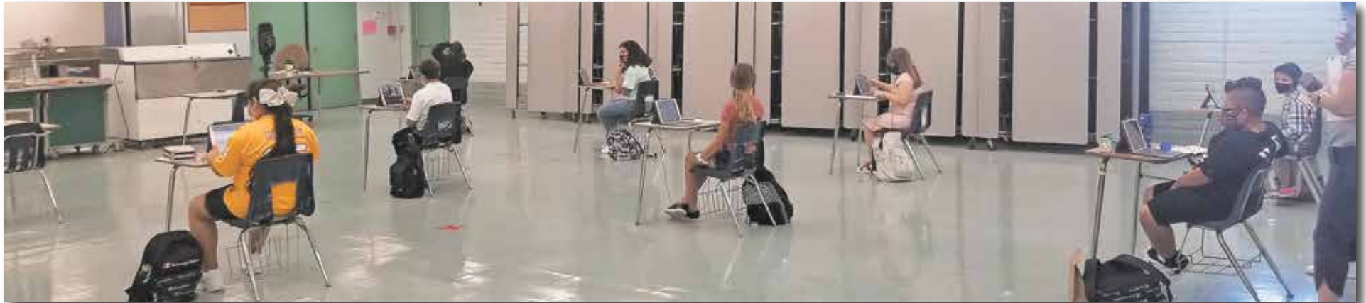
Teachers behind plexiglass, students sitting at socially distanced desks, most kids learning from home. The 2020-2021 school year looks a lot different from last year.