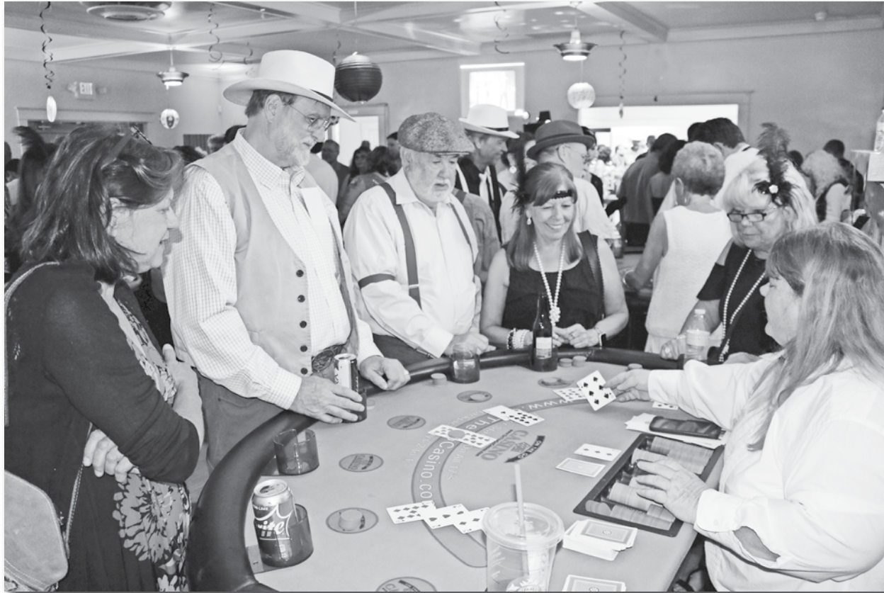
The ever-popular Magma Royale, the Superior Optimist's premier fundraiser, will return to Superior in January.