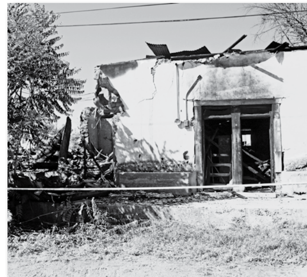
Only the walls remain of the Old Courthouse in Mammoth after a fire.