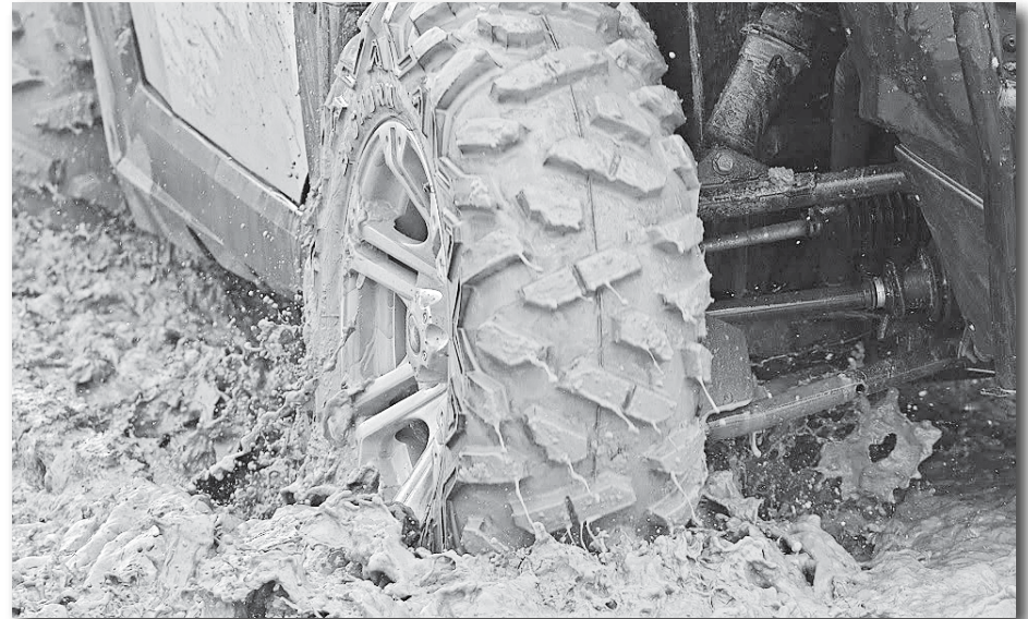
Driving off road in your OHV when it's muddy can damage the environment.

use or to sign up for a safety education course, visit azgfd.gov/OHV .