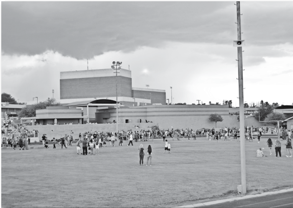
Haley Downing | SMHS