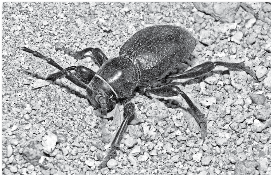
Longhorn cactus beetle.

Please check the Oracle State Park website for continuing updates. https://azstateparks.com/oracle/events