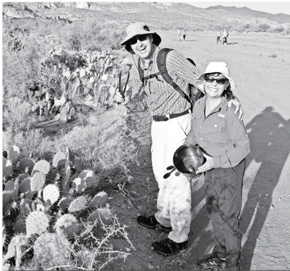
Cautiously harvesting the fruit of the prickly pear.