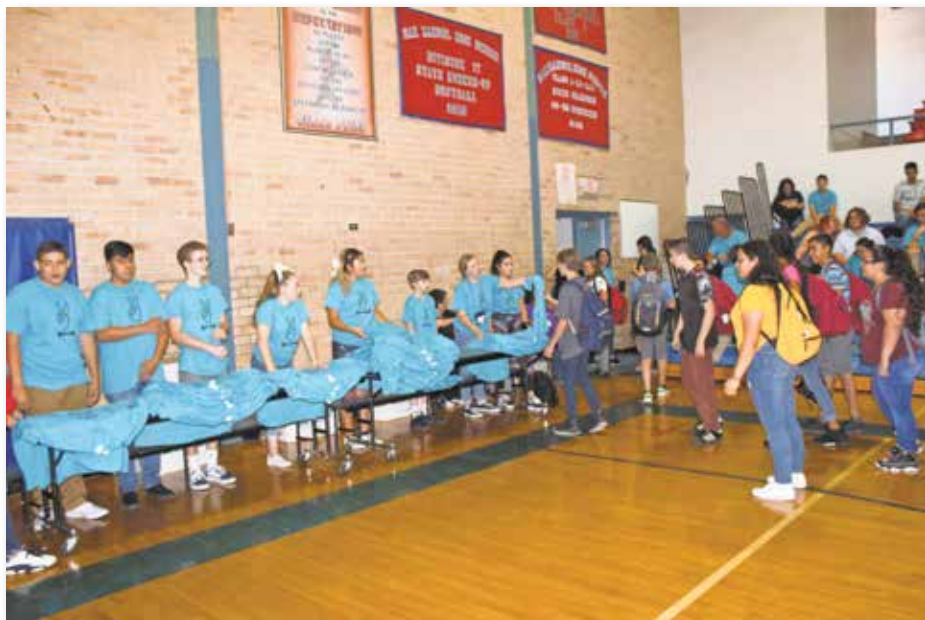
T-shirts for all. Students will wear the anti-bullying t-shirts on Wednesdays.