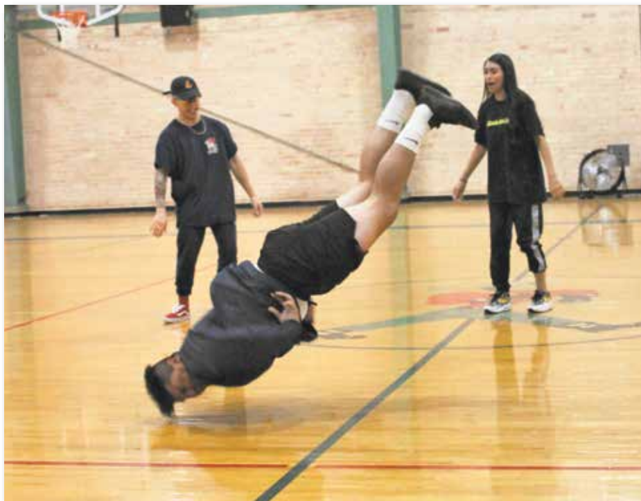
Members of United Dance Studio from Coolidge, Arizona had the students cheering and applauding to their Hip Hop dance moves, seemingly gravity defying.