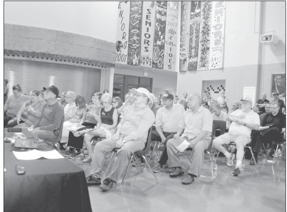
The public listens to the presentation on the proposed sites for the Resolution Copper Mine's tailings.