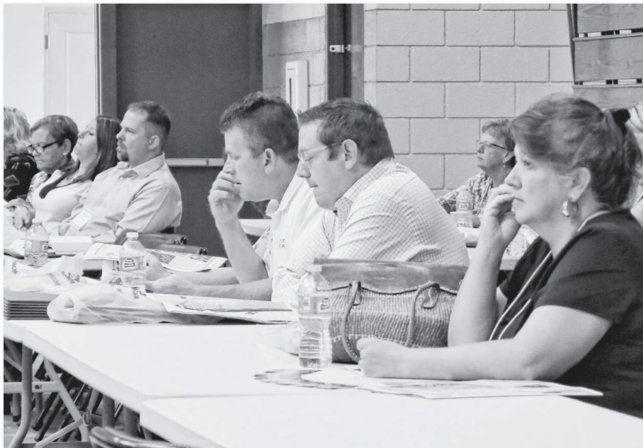
Local leaders participating in the Rural Policy Forum.