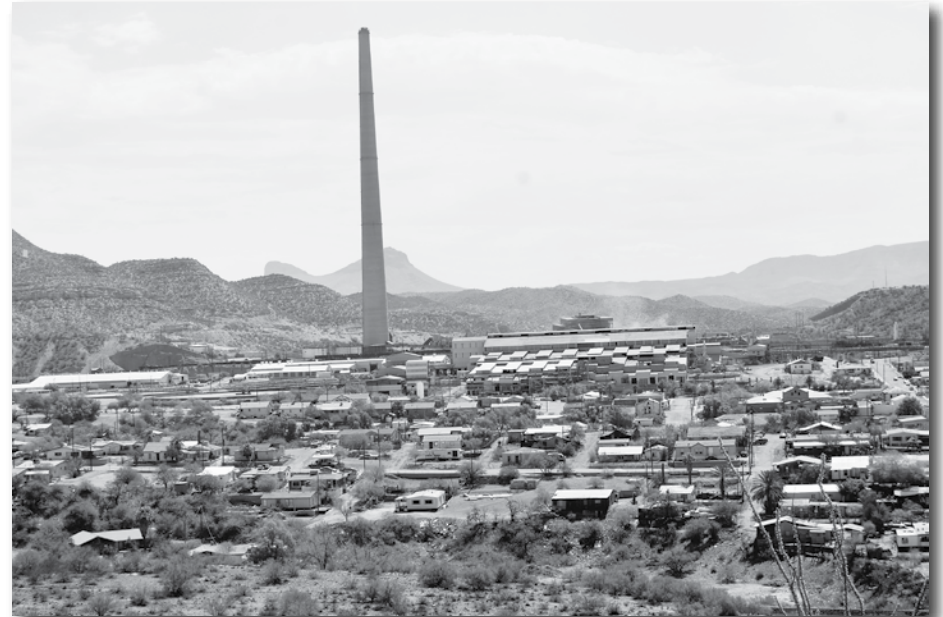
A view from San Pedro overlooks Asarco's Hayden Smelter, which is at the center of the devaluation issue.

Town of Hayden residents will be paying $8.07 per $100 of assessed value, for Hayden that is a jump of $4.00 from the previous year. Winkelman Residents will be paying $5.89 per $100 of assessed value which is not as much of an increase for town services. The biggest increase will be seen by residents in the Hayden-Winkelman Unified School District. They will have a $12.34 per $100 of assessed value to cover both the primary and secondary tax rates. While the percentages may have been the same regardless of the devaluation, the taxpayers will be paying more of the overall tax levy rather than the majority of the taxes being paid by ASARCO. Several years ago the Gila County Assessor froze the property values in Hayden/Winkelman to provide some tax relief to the residents. The values will remain frozen again this year to maintain some tax