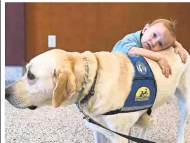
Pilot the Service Dog gets a hug from a young child.

Pilot will be available for both children and adults. He has been meeting the judges in Pinal County and has been warmly welcomed.