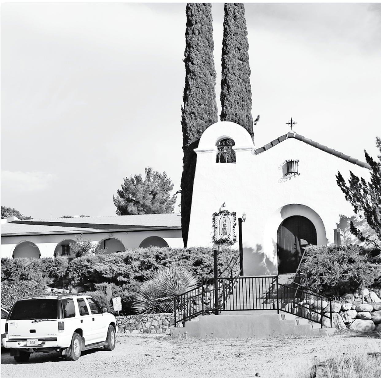
St. Helen's Roman Catholic Church in Oracle has cancelled its Fiestas in October due to the current pandemic.

St. Helen's has opened its doors to parishioners and are following safety guidelines for COVID-19. Communion is also held outside with people in their cars. They had been offering drive in services with people seated in their vehicles while mass was broadcast from inside the church. The parishioners could listen in their cars on the radio.