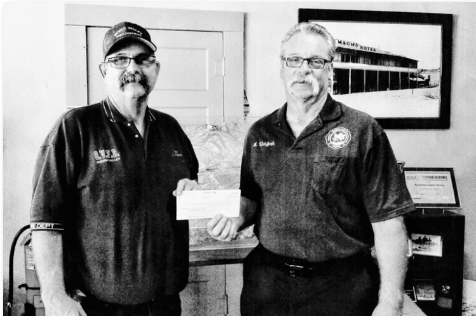
Officials from the Queen Valley Fire District are pleased with the agreement struck between the district and Resolution Copper.