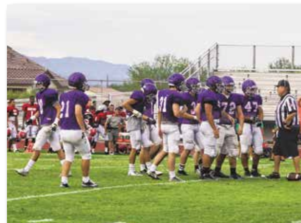
The Bulldogs' defense preps for start of last week's scrimmage.

I’d like to meet Peyton Manning. Just to ask him his experiences of his career and how he is so knowledgeable about the game of football.