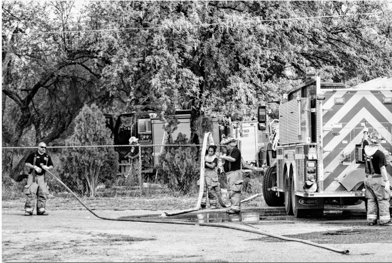
Firefighters clean up following a blaze in Dudleyville.