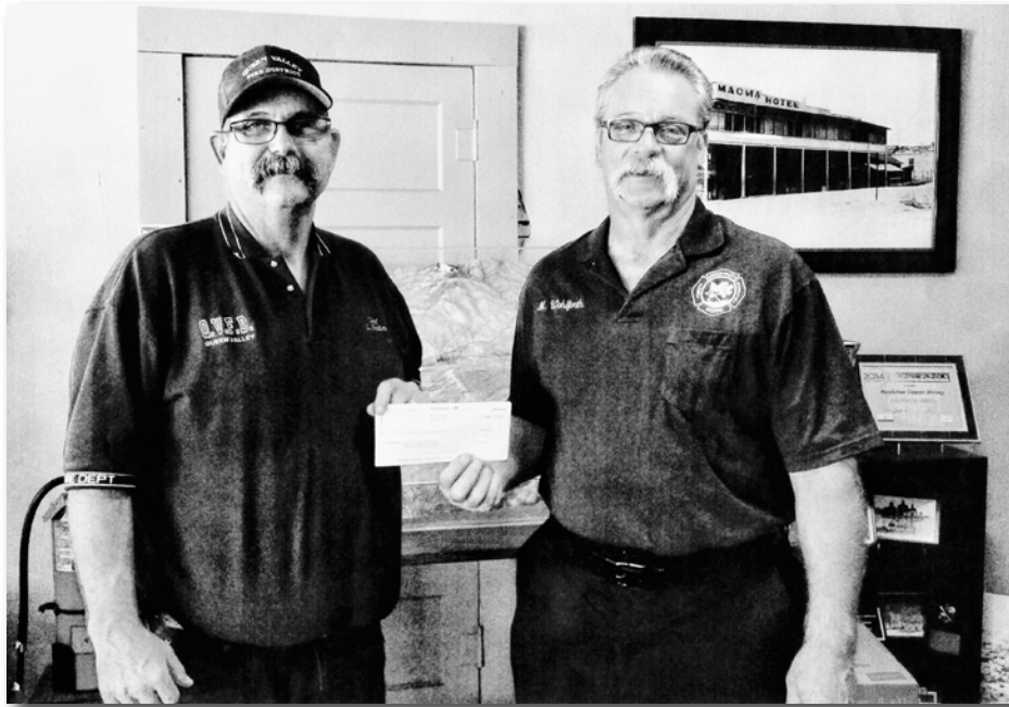
Officials from the Queen Valley Fire District are pleased with the agreement struck between the district and Resolution Copper.

The Resolution Copper Project is operated by Resolution Copper Mining, which is a limited liability company owned 55 percent by Resolution Copper Company, a Rio Tinto PLC subsidiary, and 45 percent by BHP Copper Inc., a BHP Billiton PLC subsidiary. For additional information or to download photos and videos, visit www.resolutioncopper.com/media/ .