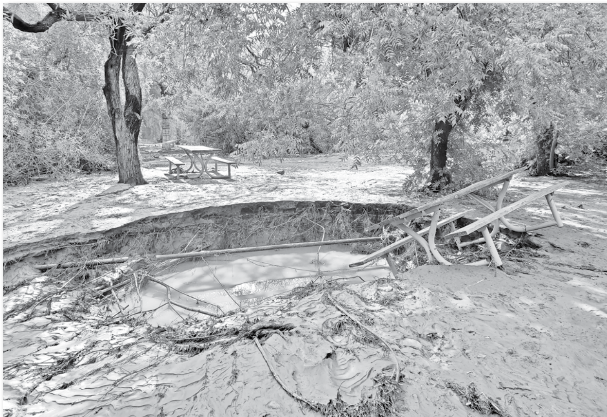
The picnic area at the Boyce Thompson Arboretum was damaged after the area was flooded during a monsoon.

Crews are working as quickly as possible to clear the debris from the streets. The Arboretum is also looking for volunteers to help with clean up and debris removals. You can contact them directly at 520-689-2723 for more information on volunteering for the clean up efforts at the garden.