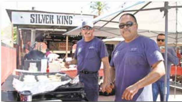
Serving up some yummy food at the pancake breakfast.