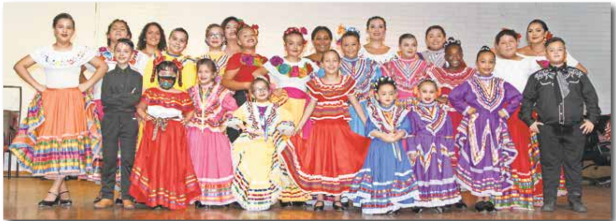
Superior Dance Company.