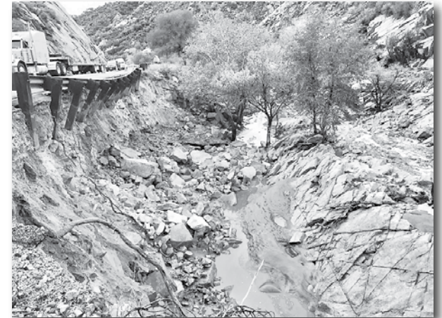
Flood damage to U.S. 60 between Superior and Miami following recent monsoon rains.