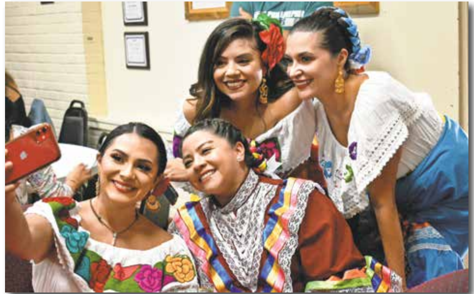
Taking that all important selfie!