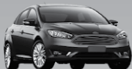
2016 FOCUS TITANIUM 4-Door

★ FREEDOM TO SAVE ★ FREEDOM FROM INTEREST ★ FREEDOM TO CHOOSE ★