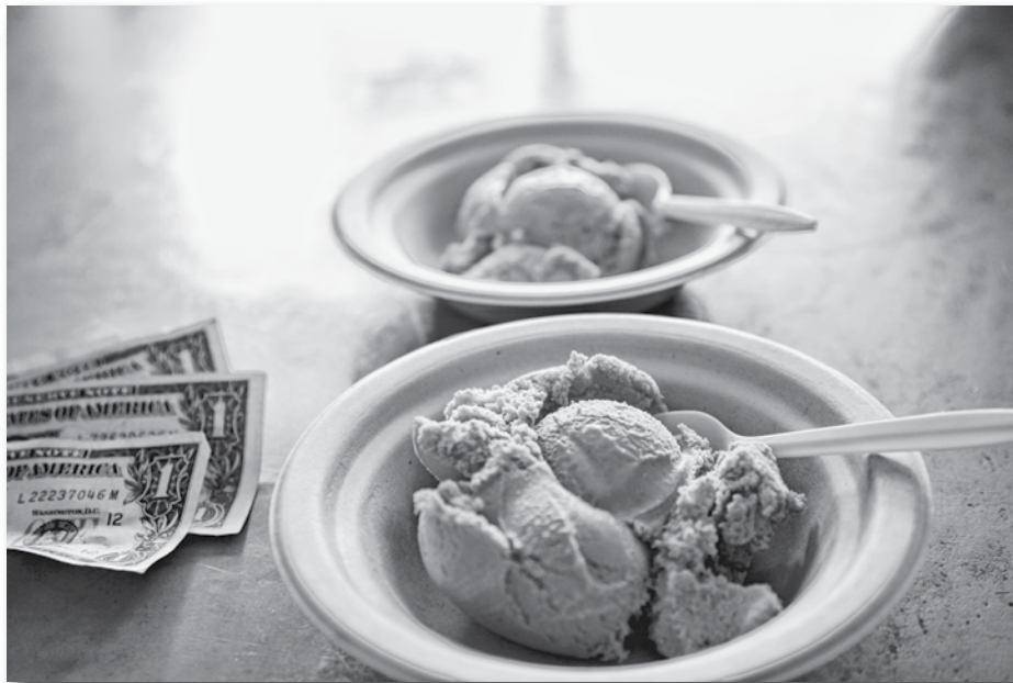
Prickly Pear Ice Cream will be one of the sweet offerings that local businesses will have during the Prickly Pear Festival.

is Zona Flamenco who will be performing traditional flamenco dancing. Tickets are $35 per person and limited tickets are available. Please contact Nancy Vogler at 520-827-9461 to reserve yours.