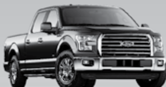
2016 F-150 XLT CHROME