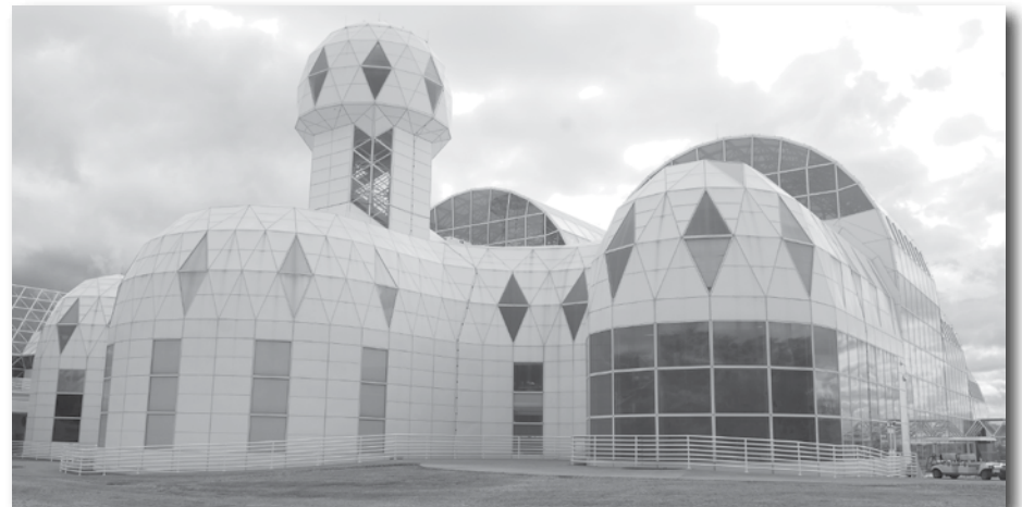
CAC students participated in the One Young World program at the Biosphere 2.