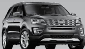
2016 EXPLORER LTD