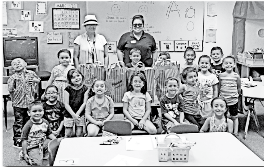
Hambly kindergartners with a representative of Norm's IGA and their donations.

The first week of school has come and gone for the students at Leanor-Hambly K-8 and the many hours and back to school routines seem something in the past, much like all the school supply shopping.