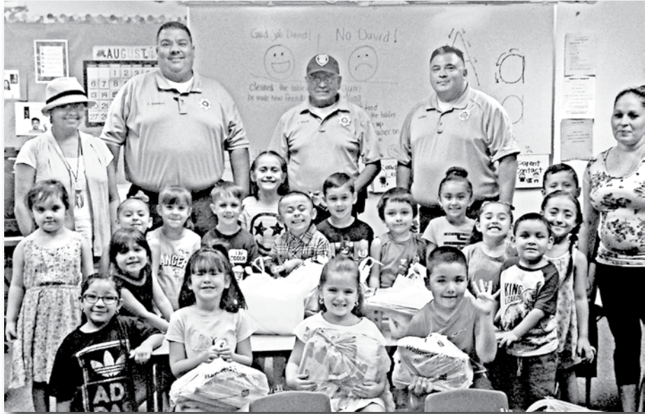
Hambly kindergartners with Department of Corrections and their donations.