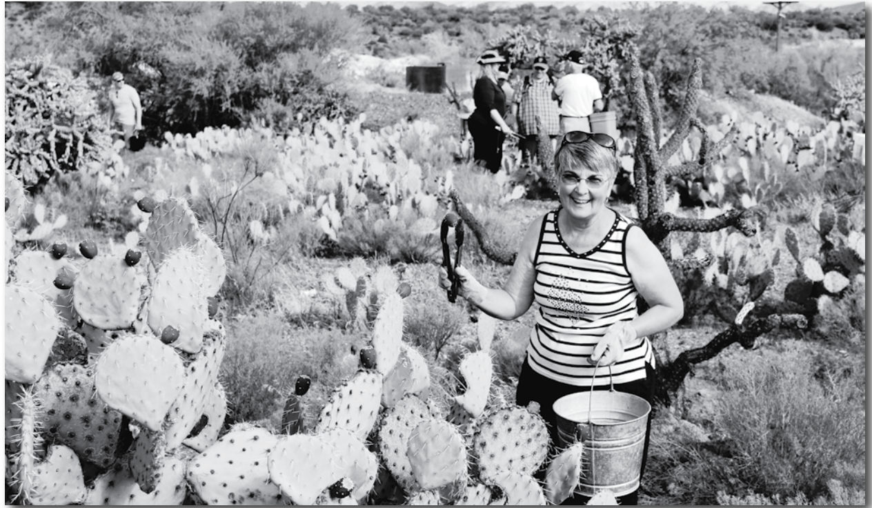
Learn how to harvest Prickly Pear fruit on Saturday in Superior.

New to the program this year is the Prickly Pear Cook-Off hosted by the Copper Communities Food Hub Study. The event has several contestants that will showcase their culinary skills using the Prickly Pear. This along with other food demonstrations will be hosted at the Superior Senior Center