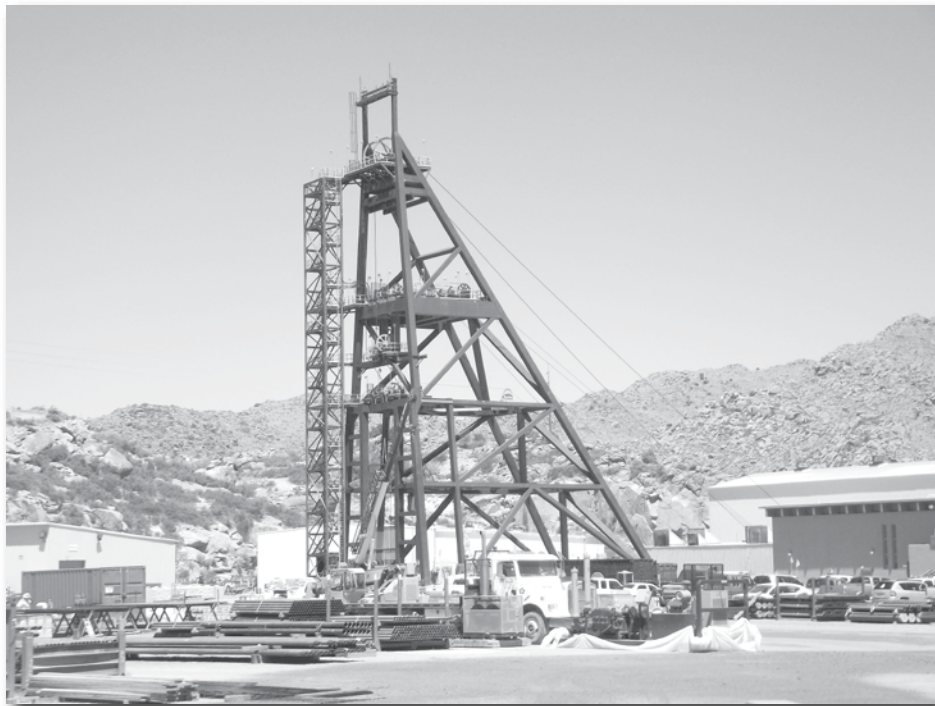
The headframe at Resolution Copper's primary shaft near Superior.