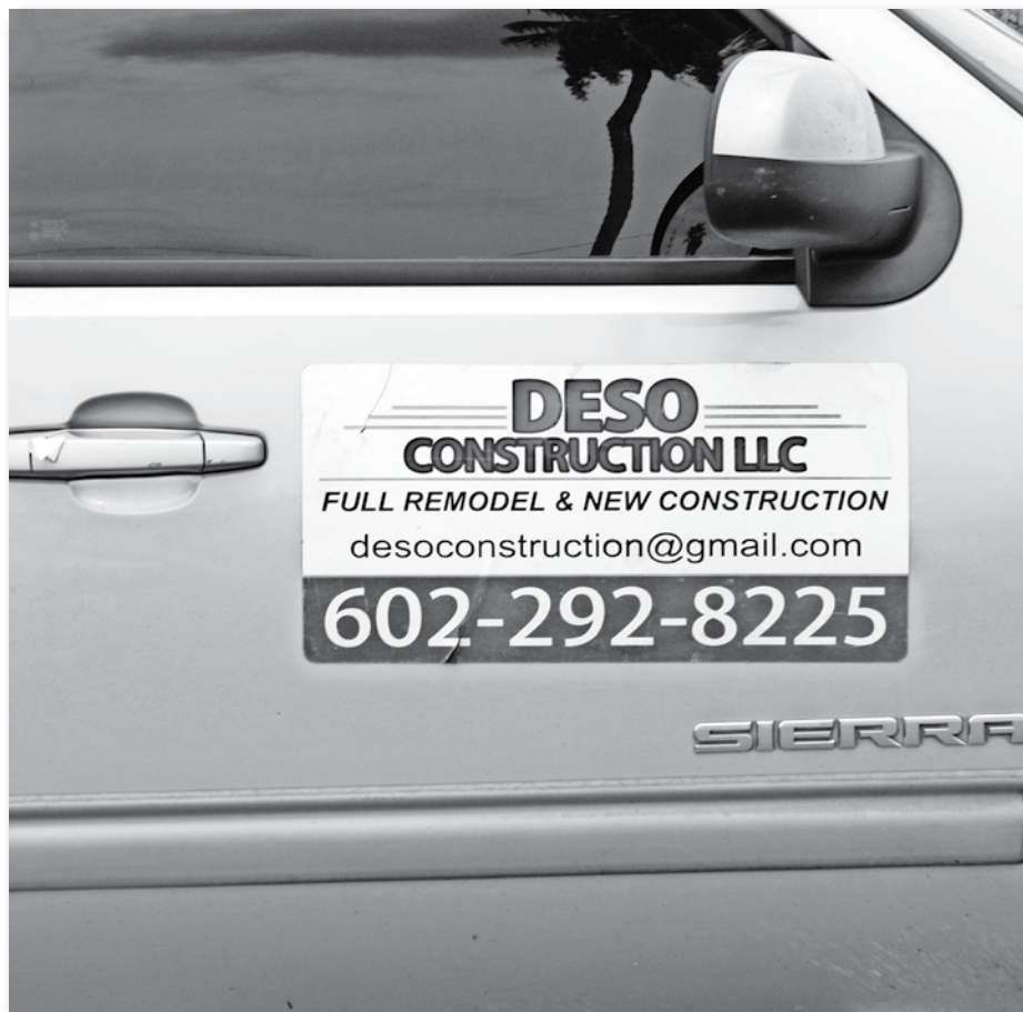
Workers with DESO Construction began working on the roof at the Kearny Retail Center on Alden Road this week. They are putting up new trusses and plywood over the Kearny Ace Hardware to the former Kearny Health Mart.