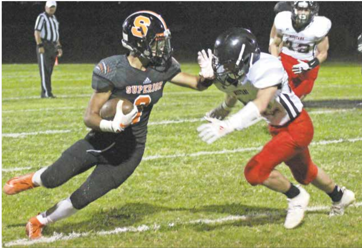
All fall sports, including football, will have a different look and feel to it during the COVID-19 pandemic.