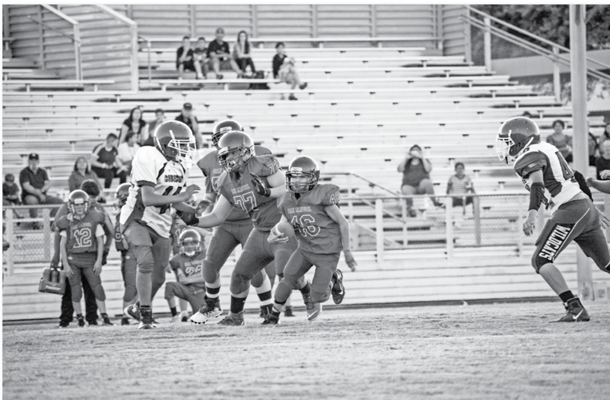
San Manuel Junior High School football will have the same constraints as the high school team with games and practices.