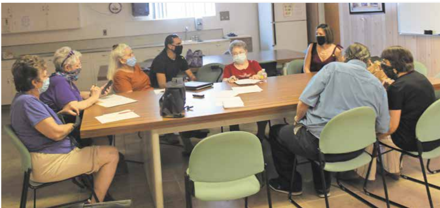
The Copper Town Association Board meets at the Sun Life Family Health Care Center in San Manuel.

The survey is available on the San Manuel Revitalization and Copper Area Facebook pages. A link can also be found in the related story.