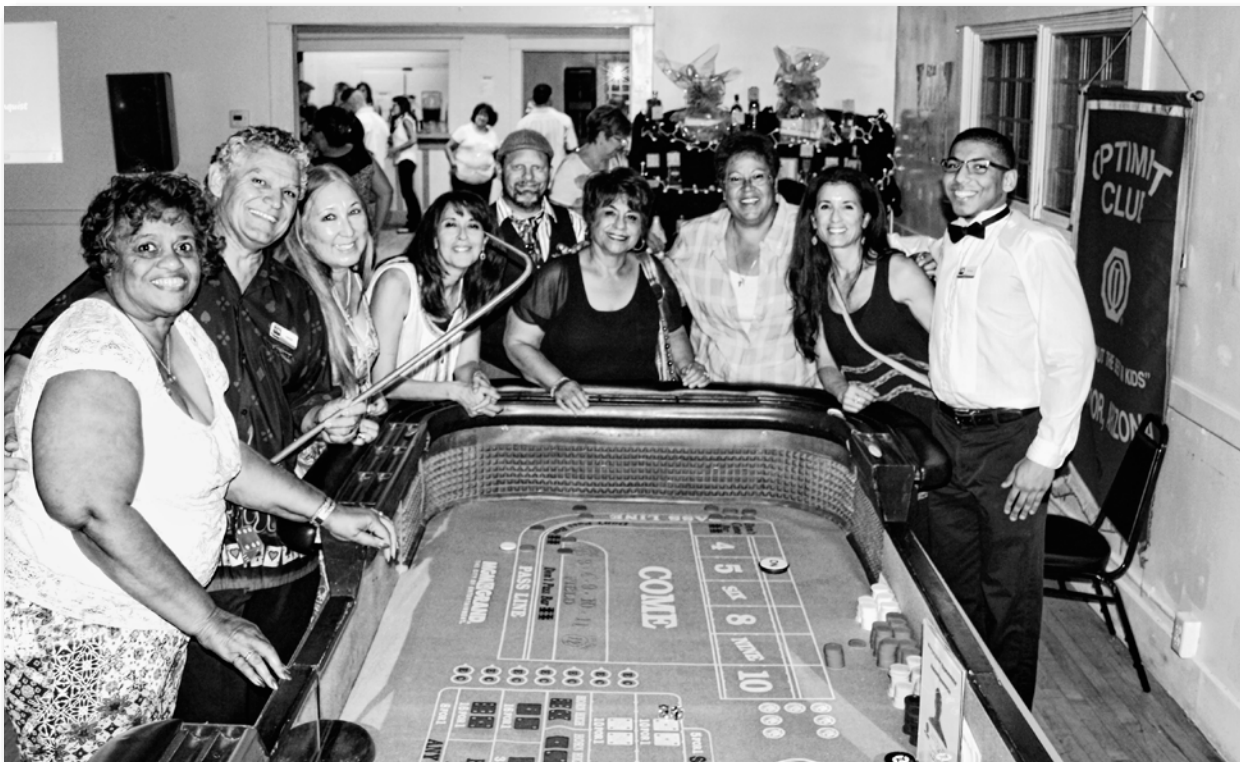
So does what happens in Superior stay in Superior? Casino Night goes had fun Saturday at the Superior Optimist Club event.