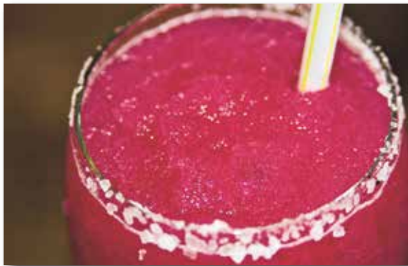
PRICKLY PEAR MARGARITA

I hope you'll attend the Fourth Annual Prickly Pear Festival and enjoy your time in Superior as much as I do.