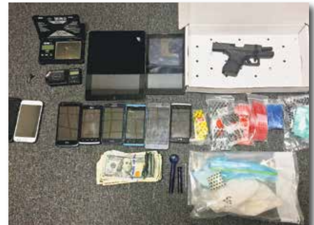
Items seized during the most recent drug bust by the K9 Unit, Officers Lawrence and Ace.