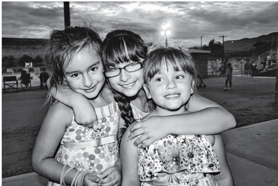
Happy sisters wait for the fireworks to start.