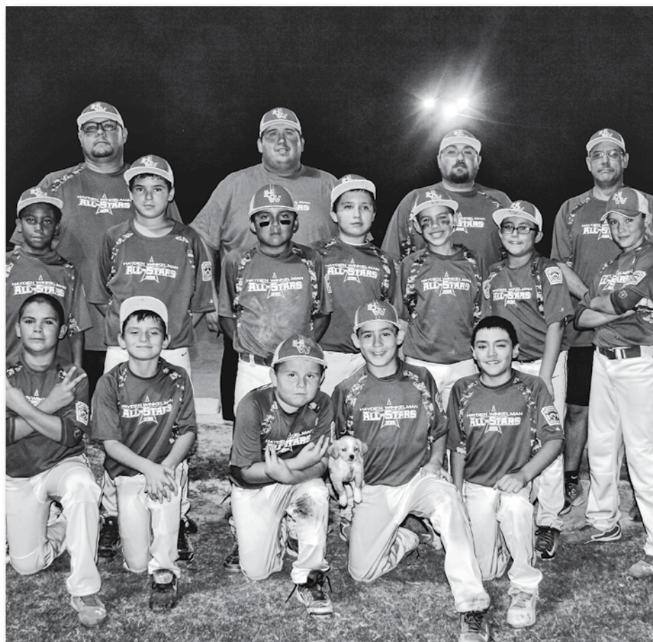
Hayden Little League All-Stars win the July 4th game.