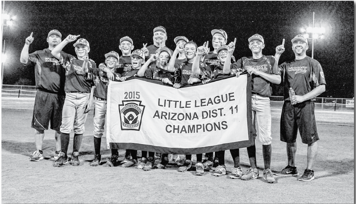
It's on to the State Tournament for the Kearny Little League Major All-Stars.

For more information in addition to complete results and brackets visit the Kearny Little League Facebook page and www.eteamz.com/azstatell .