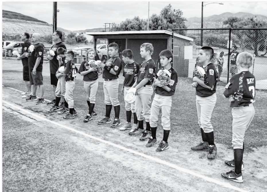
Kearny Little League team lines up before the game.