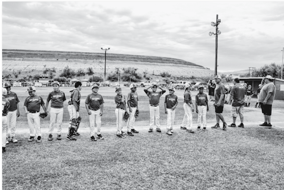
Hayden Little League team lines up before the game.