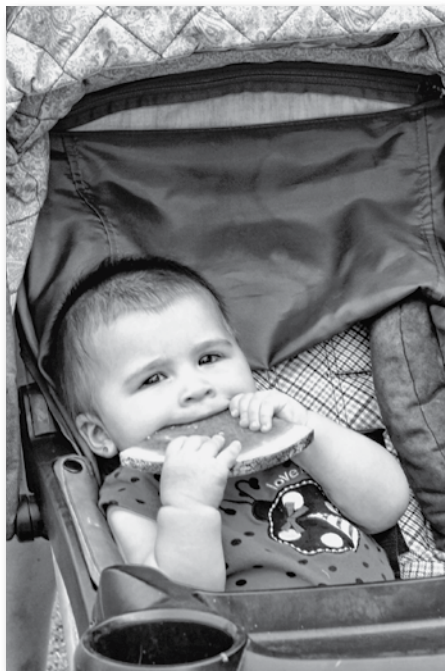
Enjoying some watermelon.