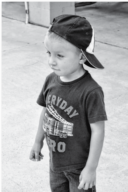
Checking out what's going on.