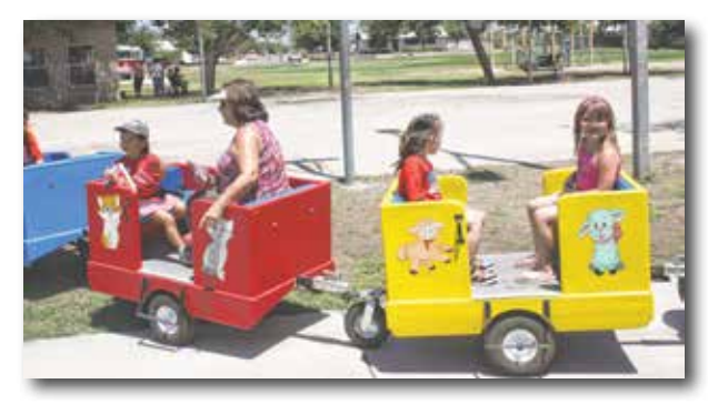
All aboard the Good Shepherd Express.